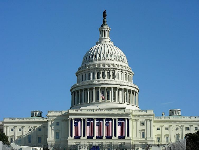
US Capitol Building, Washington