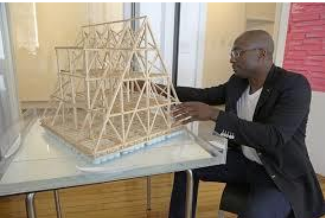
Handmade School, Rudrapur, Bangladesh

Freedom of Speech or Respect for other's Religion. And what does it mean for style of integration.