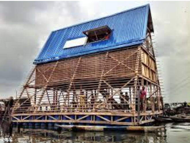
Makoko Floating School