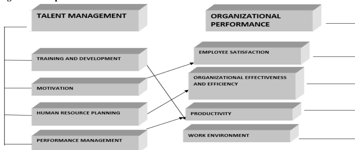
Figure 2.1.1. Model of the relationship between human resource management practices and organizational performance

The conceptual model presented below shows the different relational links in the talent management and organizational performance relationship. The first part of the model conceptualizes training and development and productivity. The second part conceptualizes the relationship between motivation and employee satisfaction. The third depicts connection of personnel planning with work environment. Finally, linkage of performance management and organization effectiveness and efficiency are depicted in the fourth part.