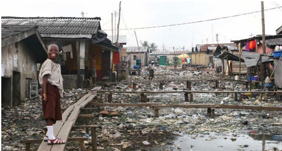
Fig. 1 An urban slum in Lagos, Nigeria.

been burnt and the land's fertility is drastically reduced. In the same way, unintended consequences such as forced migration, social distortion or dislocation, internal displacements and a host of others resulting from poor planning as shown in Fig. 3 make urban renewal in Nigeria like the prototype of agricultural slash and burn approach as the people who the government intends to do good to are most times socio-economically harmed instead.