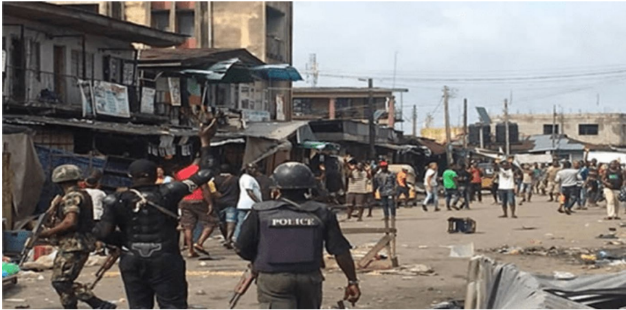
Fig. 4 Forceful eviction and demolition in Owerri, south-east Nigeria.