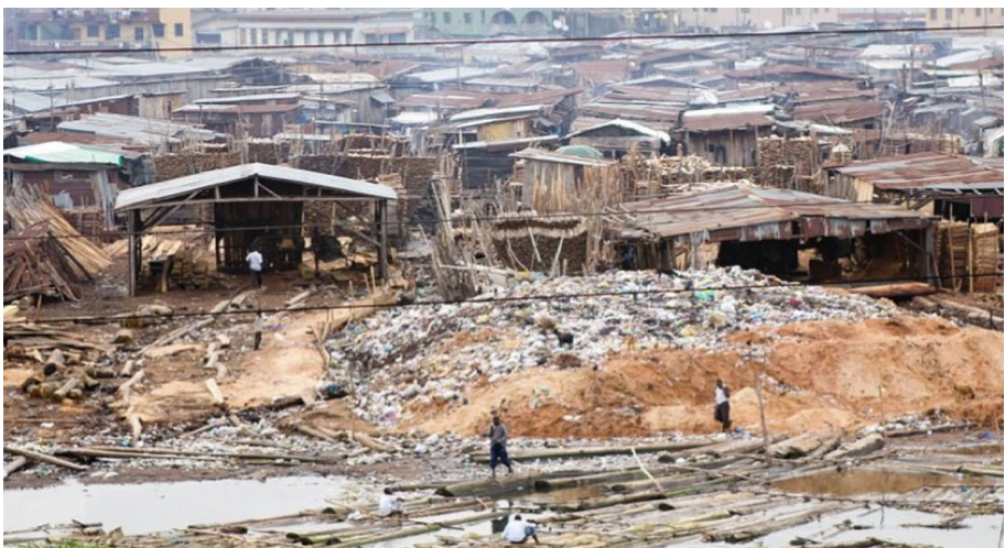
Fig. 3 A typical slum in a suburb of Lagos, Nigeria.