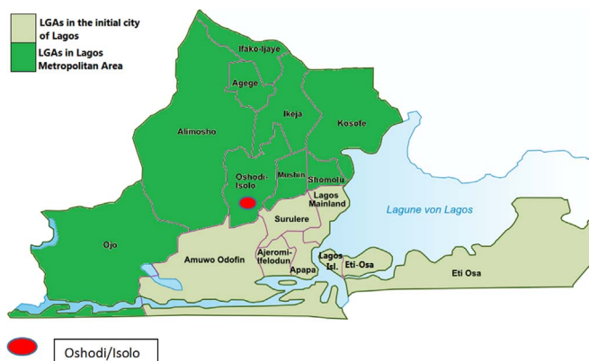
Fig. 1. Map of Lagos showing the study area.