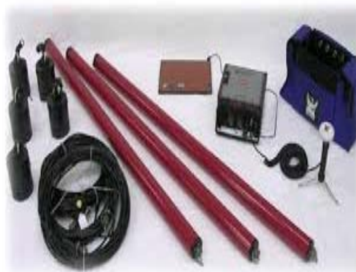
Fig. 2: Magnetotelluric electromagnetic soundings; http://en.openet.org/wiki/Magnetotellurics