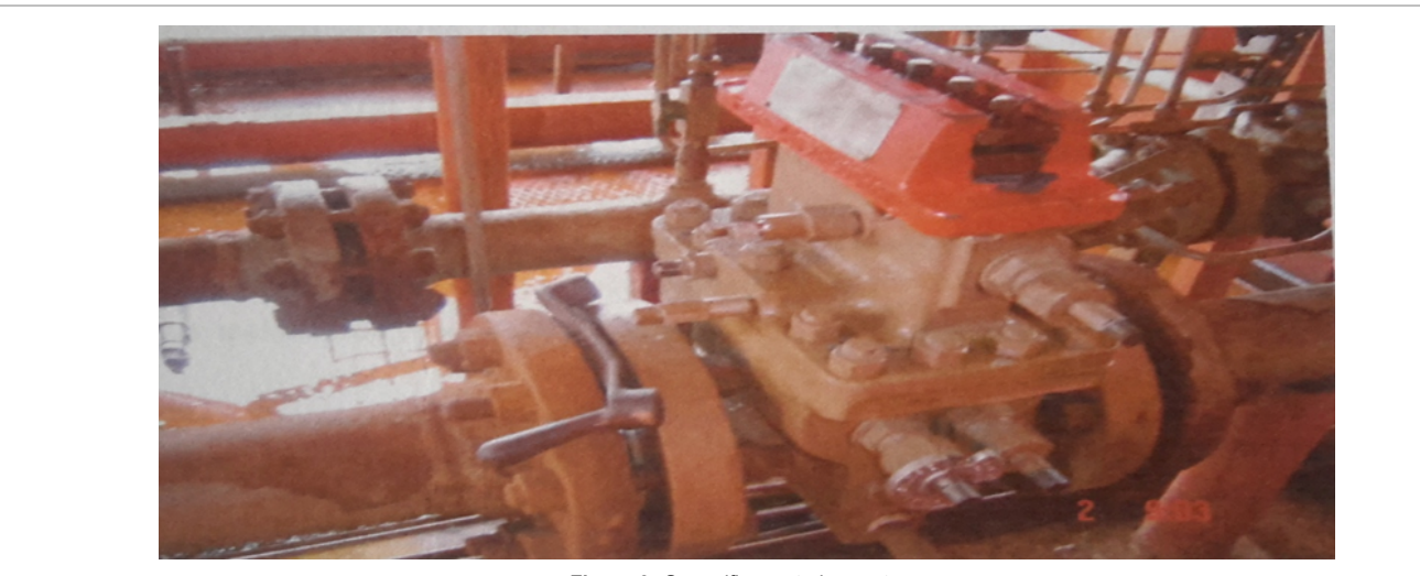
Figure 3: Gas orifice metering system.

Citation: Okoro Emeka E, Kevin I, Angela M, Charles O, Evelyn EB (2017) Offshore Gas Well Flow and Orifice Metering System: An Overview. Innov Ener Res 6: 163. doi: 10.4172/2576-1463.1000163