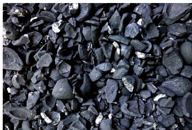
Figure 3. Carbonized Palm Kernel Shell (PKS)

of solid eventuated by the pyrolytic action under a controlled atmosphere. Figure 3 below shows the carbonized PKS.