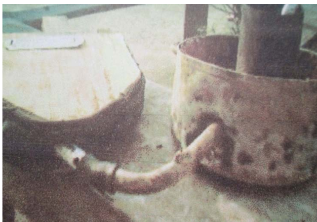
Figure 2. Bellow and Crucible furnace set-up

The furnace set-up is shown in figure 2 on charging the furnace with the carbonised palm kernel shell the fuel is ignited with an ember; after ignition the crucible is lowered into the combustion chamber with the charge inside, the bellow is operated continually until the charge becomes molten and the crucible is lifted out with a thong and the molten metal is poured into the mould.