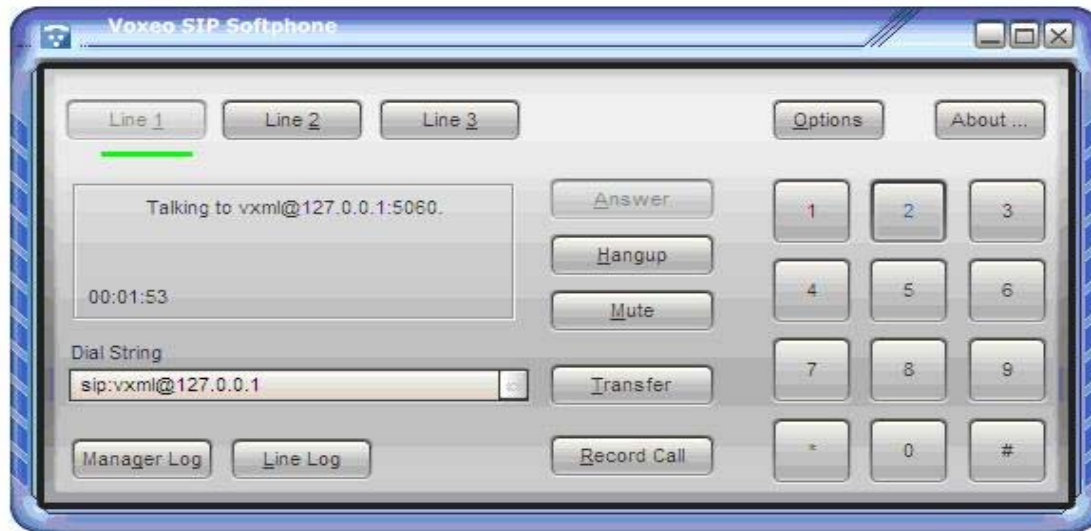
Figure 4: Voxeo Prophecy SIP Softphone keypad

or 009-1-206-7925679 from any mobile or land phone from Nigeria (009) will connect to, and execute the application. To access the application from another country, replace 009 with source country int. dial out #. The default patient card number to log in is cartman .