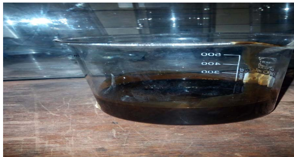
Fig. 3. Sample of bio-oil extracted from cassava peels by pyrolysis.