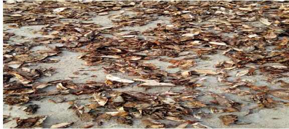
Fig. 1. Cassava peels.