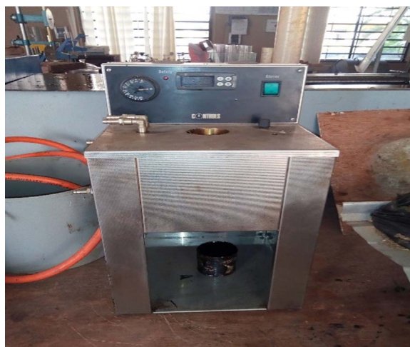
Fig. 5. Viscometer.