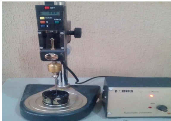
Fig. 4. Penetration apparatus.

modification was the % passing sieve no 200 mm diameter mesh. The bio oil was extracted by pyrolysis, which involved the combustion of the dried cassava peels at a temperature of 529 °C, in an anaerobic condition i.e. in the absence of oxygen and consequently produced solid (bio char), bio-oil, and bio gas. Bitumen was blended with the milled crumb rubber using a high speed shear emulsifying machine at 180 °C [9], at 5%, 10%, 15% and 20% respectively and subsequently bio-oil was added to the mixture. The modified samples produced were subjected to penetration, density, ductility, flash and fire point, viscosity, loss on heating, softening point, specific gravity tests and water content tests using the appropriate testing equipment such as viscometer, Marshall Stability machine and others and the values are as presented. Marshall Stability and flow tests were carried out on the resultant crumb rubber bio asphalt mix produced (Figs. 4 and 5).