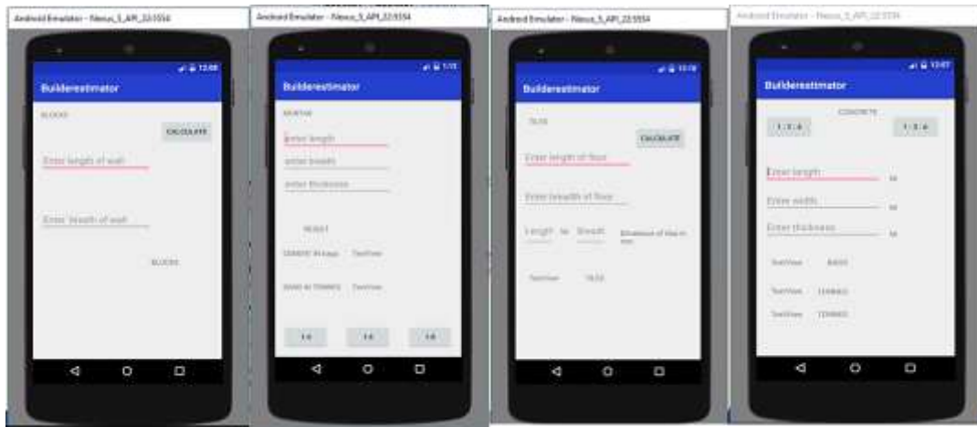
Figure 4. Screen shot of View Classes of the Android-based Estimating App