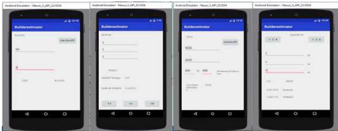
Figure 6. Estimated Quantities View in the Android-based Estimating App