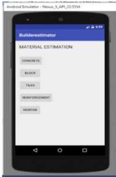
Figure 3. Screenshot of the layout of the Android-based Estimating App