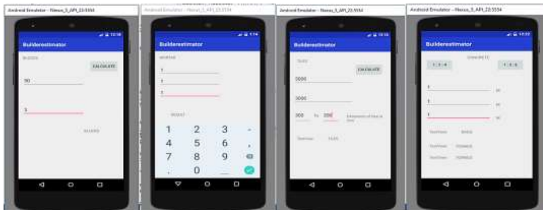
Figure 5. Input of Dimensions in the Android-based Estimating App