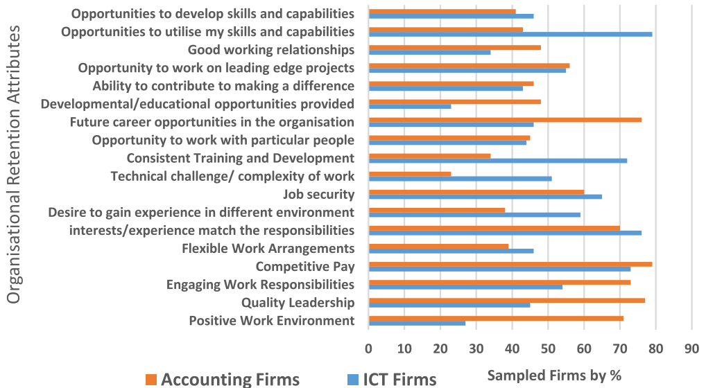
Fig. 1. Retention attributes of the sampled firms.

available in Table 2, which exhibit that the coefficient correlation is highly correlated and are all significant.