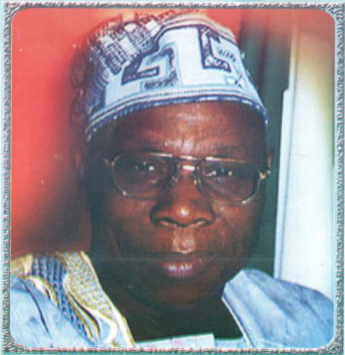
President Olusegun Obasanjo Federal Republic of Nigeria