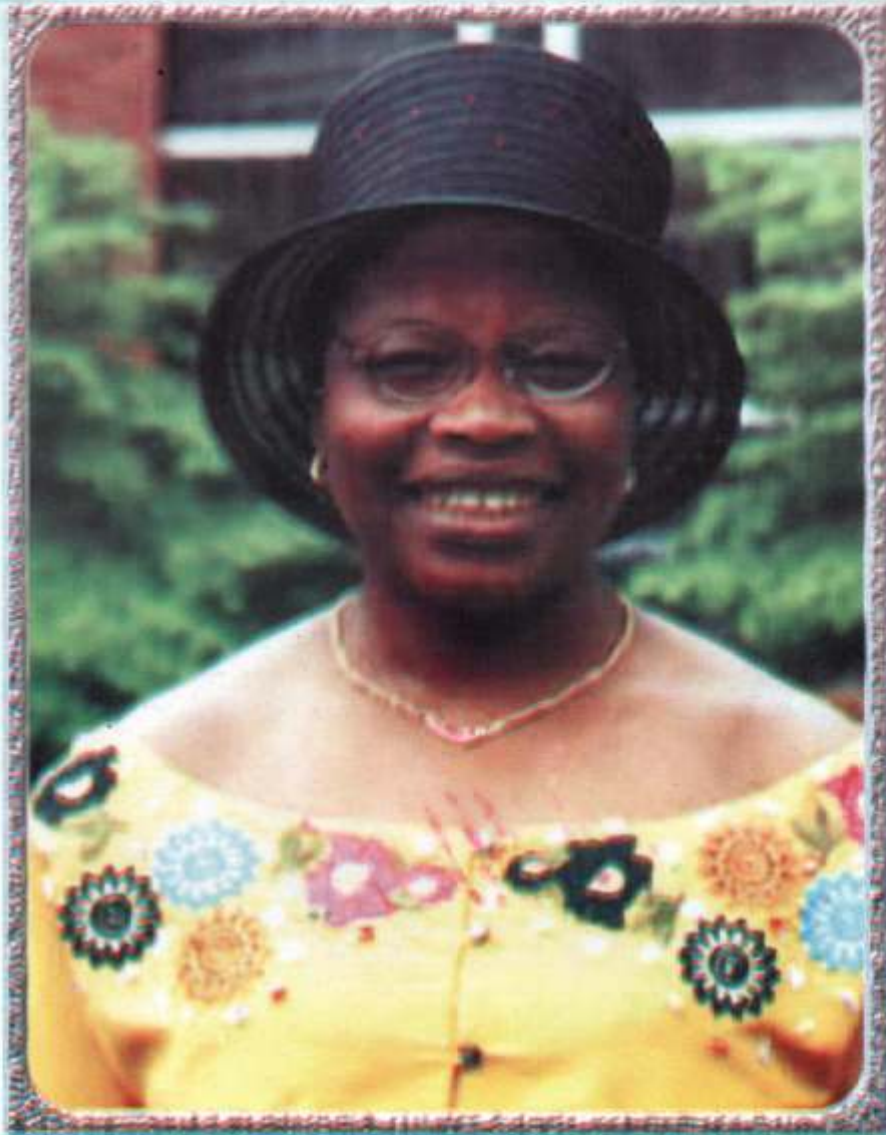
Dr Oby Ezekwesili Minister of Education