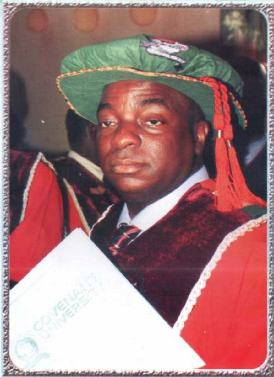
David O. Oyedepo , Ph.D., FNAE Chancellor and Chairman, Board of Regents, Covenant University, Canaanland, Ota