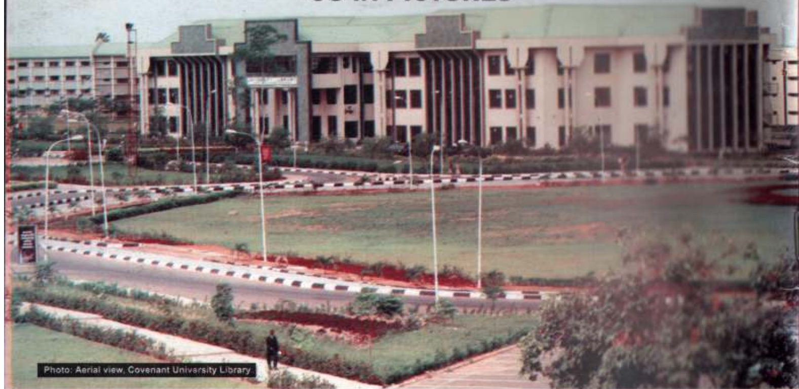
Photo: Aerial view, Covenant University Library