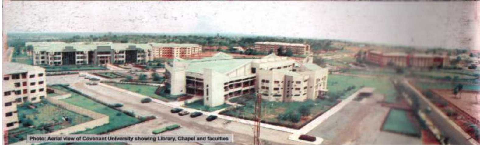
Photo: Aerial view of Covenant University showing Library, Chapel and faculties