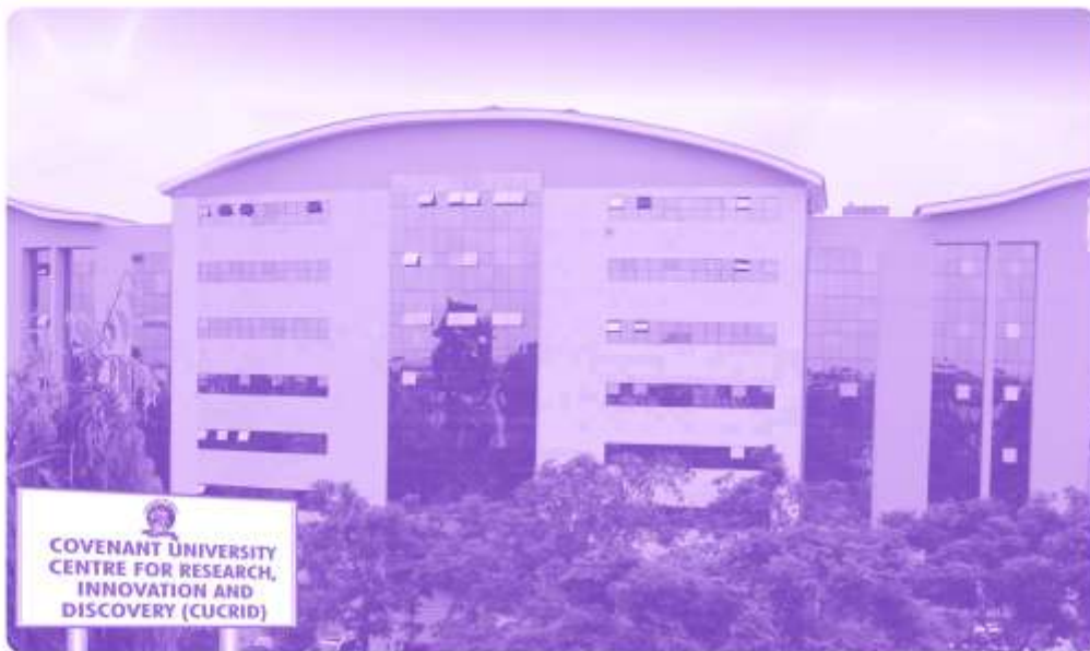
COVENANT UNIVERSITY CENTRE FOR RESEARCH, INNOVATION AND DISCOVERY (CUCRID)

For the Award of First and Higher Degrees and Presentation of Prizes