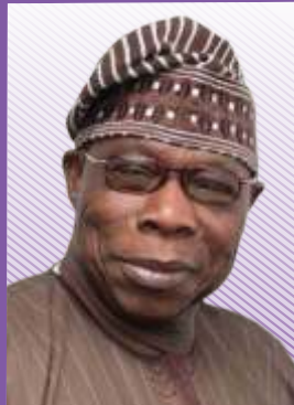
SPECIAL GUEST OF HONOUR CHIEF OLUSEGUN OBASANJO Former President, Federal Republic of Nigeria