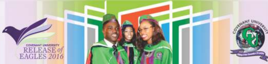
Covenant University 11 th Convocation Ceremony