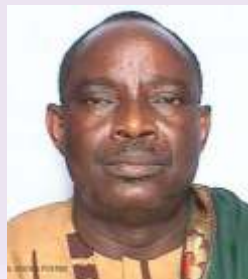
SEN. FOSTER OGOLA Chairman, Senate Committee on ICT & Cyber Security