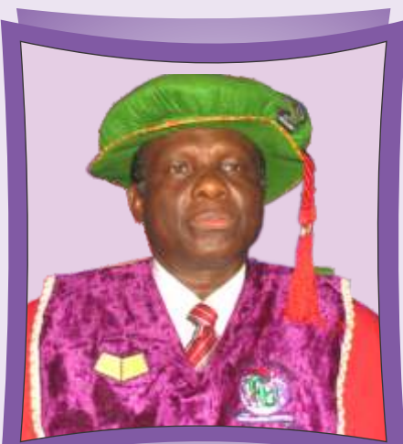
PROFESSOR JERRY GANA, CON FORMER NIGERIAN MINISTER FOR INFORMATION AND ORIENTATION; PRO-CHANCELLOR/CHAIRMAN OF GOVERNING COUNCIL, UNIVERSITY OF LAGOS

B orn on 30 th November, 1945 at Busu near Bida, in Niger State, Professor Jerry Gana obtained the West African School Certificate from Government College, Bida in 1964, and proceeded to Okene Secondary School for the Higher School Certificate from 1965-1966, passing out with the best H.S.C results in 1967 (with distinctions of A; A; B). Thereafter, Prof. Jerry Gana proceeded to Ahmadu Bello University and graduated in 1970 with a B.A. (Hons) degree (Upper Division). After graduation, he proceeded to the famous Kings College of the University of Aberdeen, Scotland, for an M.Sc Course in Rural Resources Planning, leading to a Ph.D in Marketplace Systems and Rural Development in 1974. He further obtained a Certificate of Education from the University of London and taught at Ahmadu Bello University, Zaria from 1974 to 1986, rising to the post of a Professor in 1985.