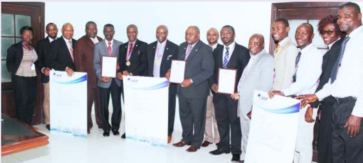
Our three innovative products- Energy Retention Bag, Solar Powered Weather Station and Green Luminaire- won 3 Gold Medals at the World Invention and Innovation Forum 2015 in Yancheng, China and 1 Gold and 2 Silver Medals at the 67th IENA International Trade Fair for "Ideas, Inventions, New Products" 2015 in Nuremberg, Germany.