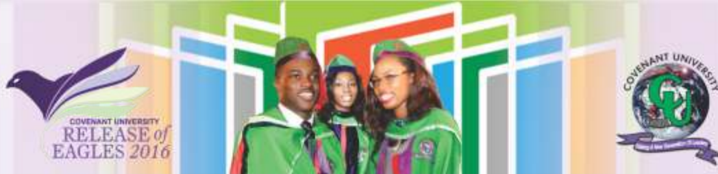
Covenant University 11 th Convocation Ceremony