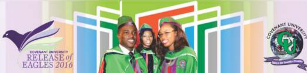
Covenant University 11 th Convocation Ceremony