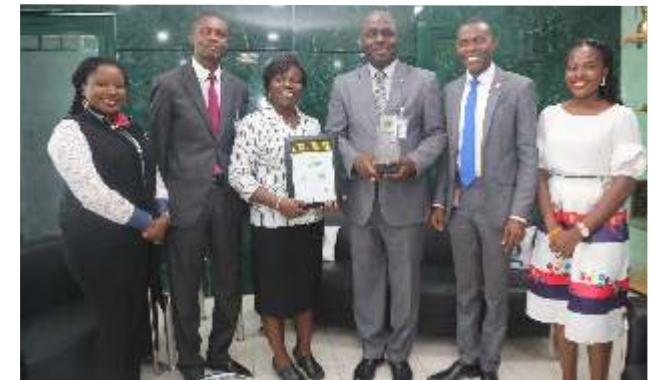
Most Outstanding University Award by Nigerian Entrepreneurs' Award 2018