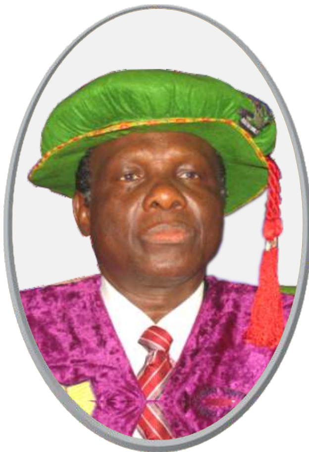
Professor Jerry Gana , CON, Ph.D, DD, FRGS, FNASS, FNIPR Former Nigerian Minister of Information & Orientation, Pro-Chancellor/Chairman of Governing Council, University of Lagos.