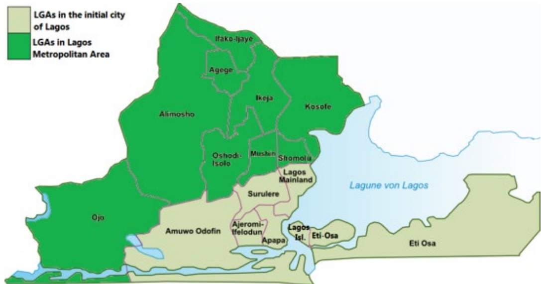
Figure 1. Map of Lagos State

In this study, an in-depth literature review was used to sift through the prospects and barriers to vertical architecture construction in Lagos State. Materials included published articles from major databases on the subject matter of public housing and vertical architecture. A total of forty (40) articles were downloaded from online journal outlets and libraries while only twenty-one (21) were deemed adequate for this study. A discussion format was utilized to explain the objectives of prospects and barriers. Presently, there are over 47 megacities with Lagos State been one of them [14]. The study area of Lagos State was chosen for this study due to the peculiar challenges with housing, high population and urbanization and limited land area. Furthermore in [15], mismanagement of our land, recurring periods of building collapse, building fires, sick buildings, and urban defacement are problems faced in Lagos megacity environment. Figure 1 showed the map of Lagos State and local government areas within the State.