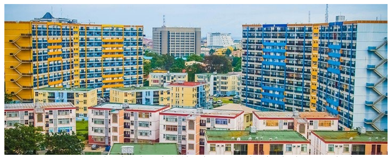
Figure 2. Elevation view of 1004 housing estate, Victoria Island, Lagos, Nigeria