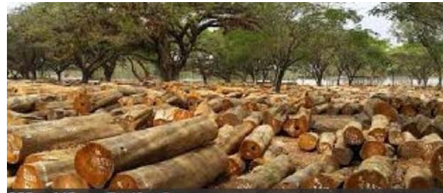
Figure 2: Australian Teak wood

Apart from Iroko, there are several other Nigerian timber species that are yet to be explored for structural use.