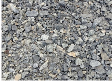
Figure 1. Coarse aggregate.

brown, liquid, chlorine-free superplasticizer that instantly disperses in water was used to increase the strength, durability and maneuverability of concrete without increasing the demand for water.