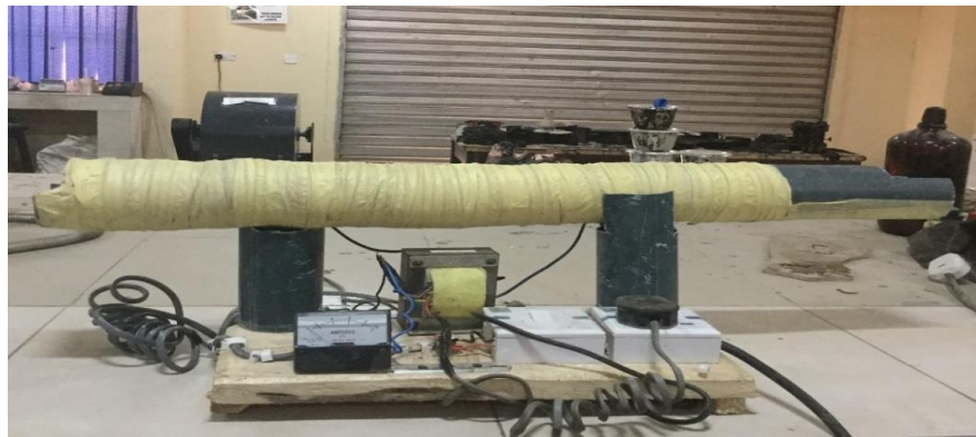
Figure 3. Magnetic field simulator.

Portable water was used in this study for the production of the concrete control mix. The source of the portal water is municipal water supply from the University laboratory while magnetic water was prepared by passing water from source through a magnetic field. In the process, magnetic water is obtained by connecting a hose from an open tap from which the water flows into the magnetic field produced by the solenoid. The water, which comes out through the other end of the solenoid is then stored in a plastic drum. The magnetic field is generated by passing current of about 32 amps through the field which is made up of a coil (turns) wound round a pipe of 600 mm length and about 100mm diameter. The current is generated from an input of 220 volts which is been step down by a transformer of 150volts. During this time the water passing through the pipe is magnetized. Figure 3 shows the setup of the magnetic device.