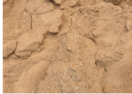
Figure 2. Fine aggregate.

Portable water was used in this study for the production of the concrete control mix. The source of the portal water is municipal water supply from the University laboratory while magnetic water was prepared by passing water from source through a magnetic field. In the process, magnetic water is obtained by connecting a hose from an open tap from which the water flows into the magnetic field produced by the solenoid. The water, which comes out through the other end of the solenoid is then stored in a plastic drum. The magnetic field is generated by passing current of about 32 amps through the field which is made up of a coil (turns) wound round a pipe of 600 mm length and about 100mm diameter. The current is generated from an input of 220 volts which is been step down by a transformer of 150volts. During this time the water passing through the pipe is magnetized. Figure 3 shows the setup of the magnetic device.