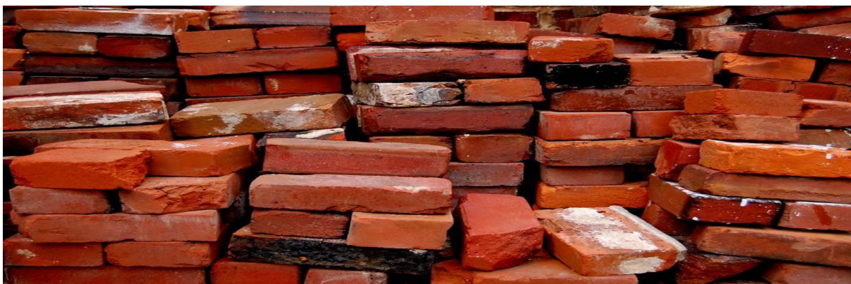
Plate 1: Cigarette Butt Bricks

According to Dziadosz & Kończak [18] stated that Innovation in construction materials produces a lighter, effective and efficient bricks from a cigarette butt. [5]. Plate 1 shows a brick produced from cigarette butt.