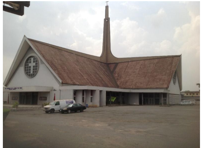
Plate 3.1: Cathedral of St. James the Great