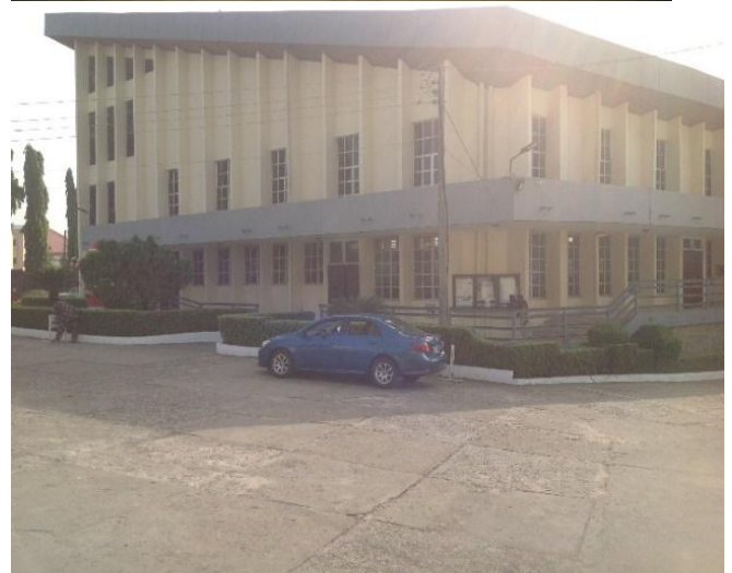
Plate 3.2: All Souls, Parish