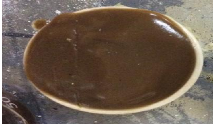
Plate 1: M. oleifera seed oil soap