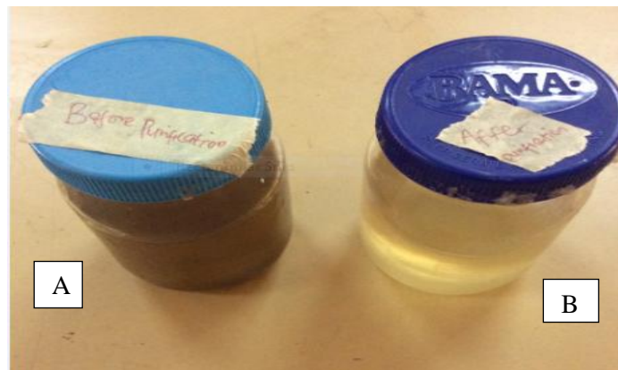
Plate 2: Sample A- Before water purification Sample B - After water purification