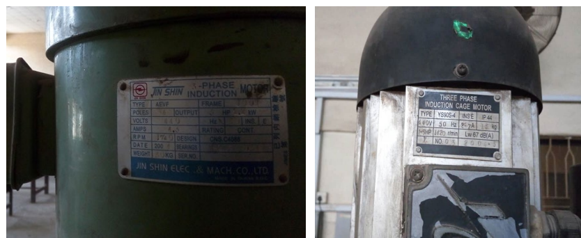
Figure 2: Nameplate specification of 3 Phase motors for (a) milling machine, and (b) drilling machine