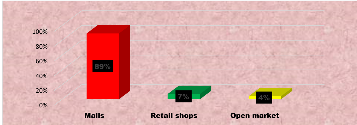
Figure 1: Percentage of respondent choice of shopping place

represent various shops and wares lined up for purchase, fun catching, sightseeing, relationship building, and business transacting.