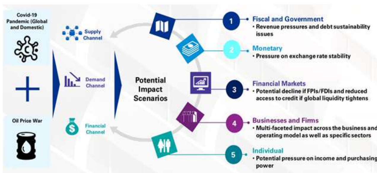
Figure 1: Possible Impacts of COVID-19 Pandemic on Nigeria's Economy

Two key issues need to be considered by policymakers for sustainable budgeting. First, is the need to understand the objectives of the national budgeting; second, is understanding the related problems of budget appropriation, implementation, and monitoring, as well as, debt vulnerability such that budgetary and economic outcomes can be improved. In addressing these issues, it is recommended that policymakers recognise that the impact of COVID-19 pandemic on Nigeria's economy will be worsened by lower domestic income and consumption; pronounced and prolonged decline in oil prices; spikes in risk aversion in global financial markets and decline in international trade. The impacts can percolate through the financial, demand and supply channels as represented in Figure 1.