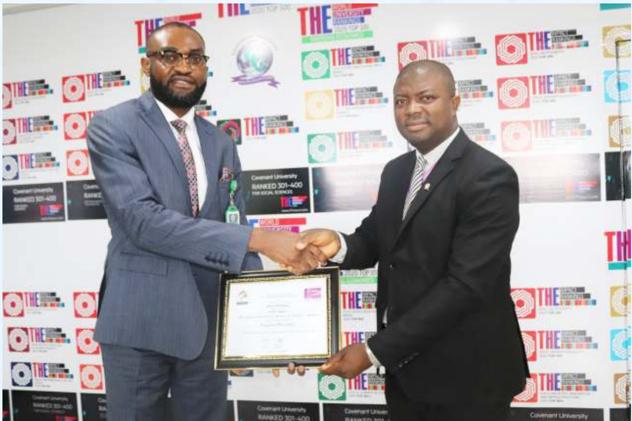
National Association of Science and Research Award Lebanon presents a special prize to Covenant University, for promoting Research and Innovation for Development in Nigeria