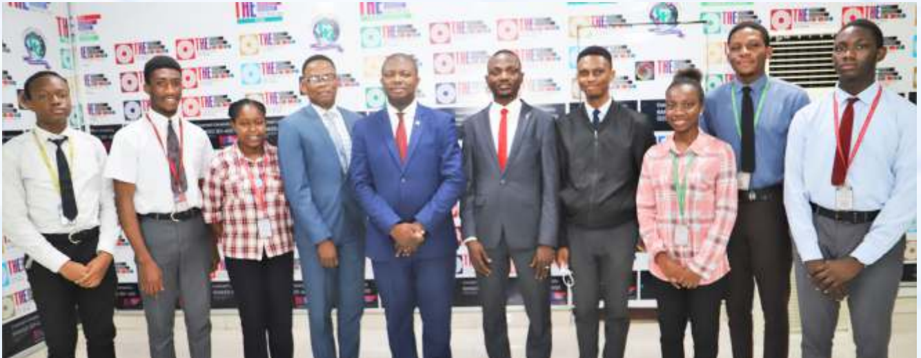
Covenant Enactus wins the International Sustainable Campus Network ISCN Award for its Pet City Project