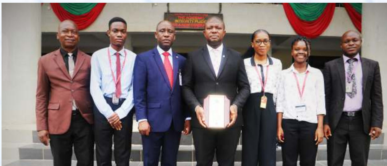
Covenant, 1st Runner-up at the 2021 National Inter-Quiz Competition for Chemical Engineering Students