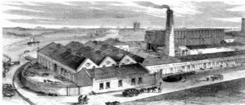
Fig.15: Built Environment in John Keats 19 th century Britain Cotton mills Manchester industrial revolution http://industrialbritain.org