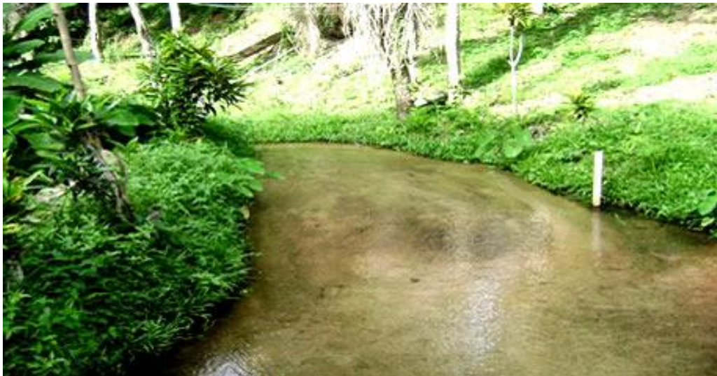
Fig. 5. Ikogosi - Ekiti Warm Spring in Western Nigeria. http://www.ehow.com/info