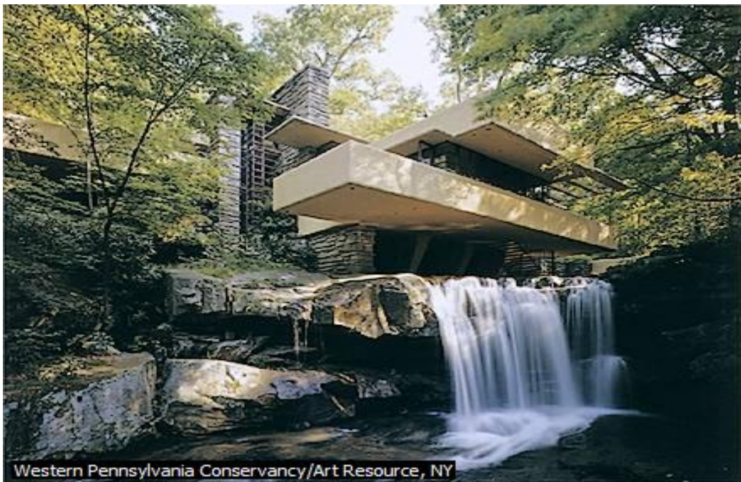
Fig. 21: 'Fallingwater House' This house is standing on a waterfall and appears to emerge from the landscape surrounding it. Designed by American architect Frank Lloyd Wright, the house was built of reinforced concrete and stone in the 1930s in Bear Run, near Pittsburgh, Pennsylvania (Encarta 2009).