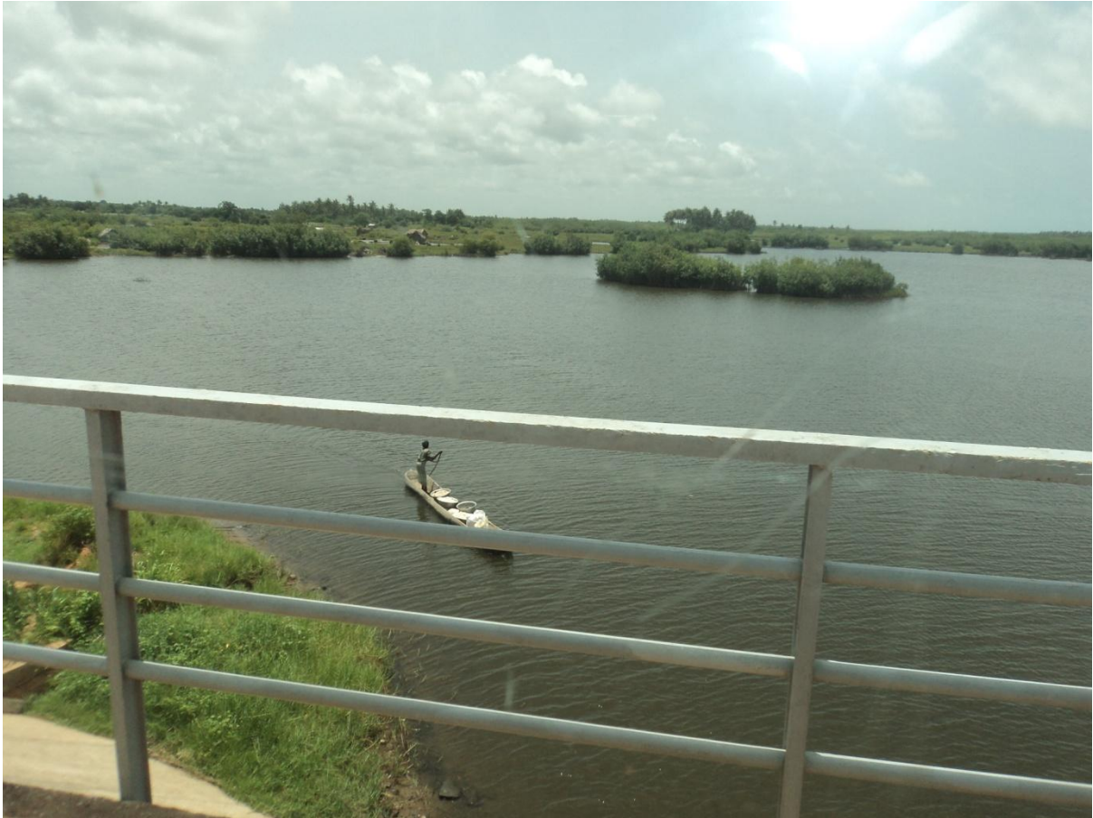
Fig. 9: Domesticated Environment: A bridge, a canoe and the landscape. This is a salt extraction site in Ouidah, Benin Republic, West Africa. Represents “What the River Said” ( Midlife , 1993:22-23)