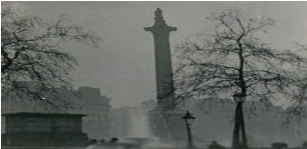
Fig.16: The Great Smog of 1952 in London. (Wikipedia, Web: July 11, 2013)