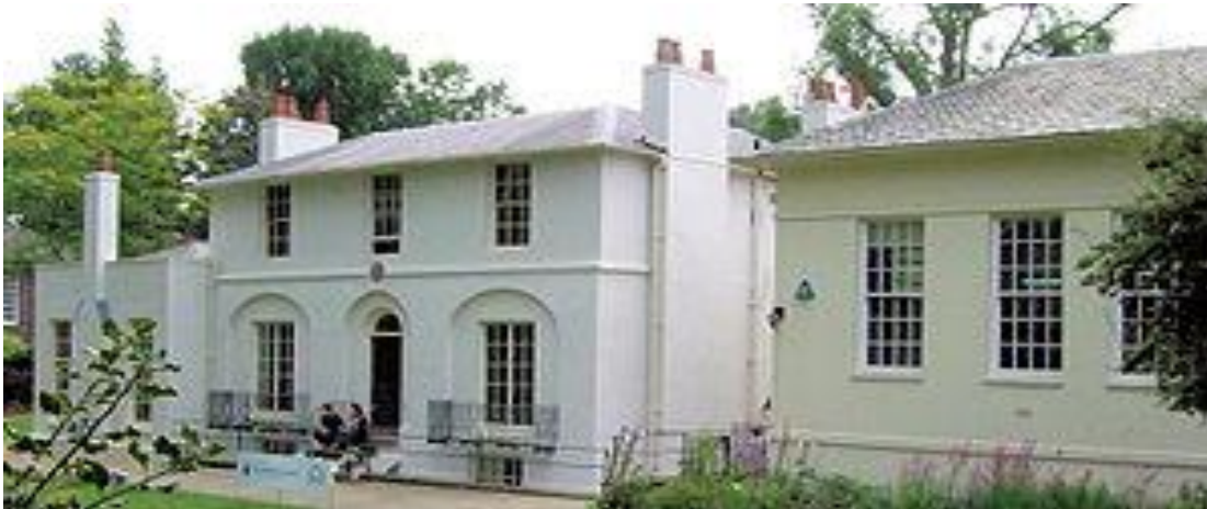
Fig. 2: Wentworth Place, now the Keats House museum (left), Ten Keats Grove (right) Where Keats' works are treasured as he prophetically said in "When I Have Fears" LL.1-4.