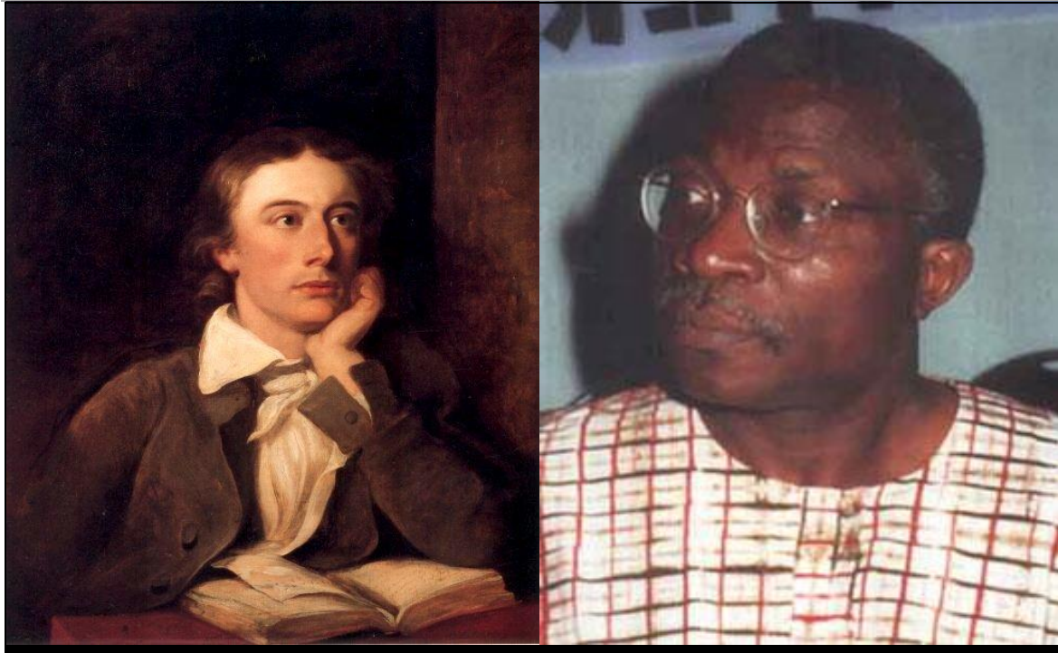
Fig.1: John Keats from National Portrait Gallery, London, and Niyi Osundare, retrieved on 13 February 2012 from Wikipedia.

John Keats (1795-1821) If Poetry comes not as naturally as the leaves to a tree it had better not come at all (Gittings,1978:46).