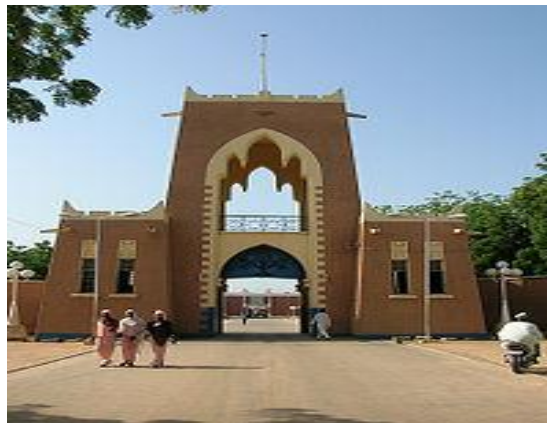
Fig. 19: Built Environment: Covenant University, Ota and Kano gate to Gidan Rumfa http://covenantuniversity.edu.ng , http://builtenvironment.wikipedia.org