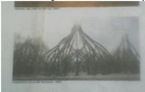
‘Weldendom’ by Sanfte Strukturen, 2001