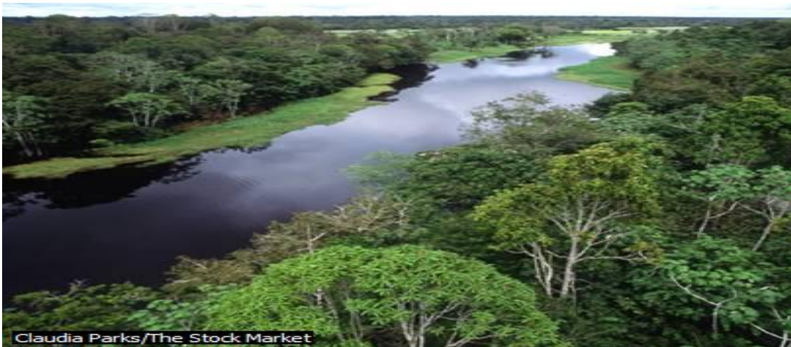
Fig. 13: The Amazon River: Wilderness Natural Environment. http://rivers.org