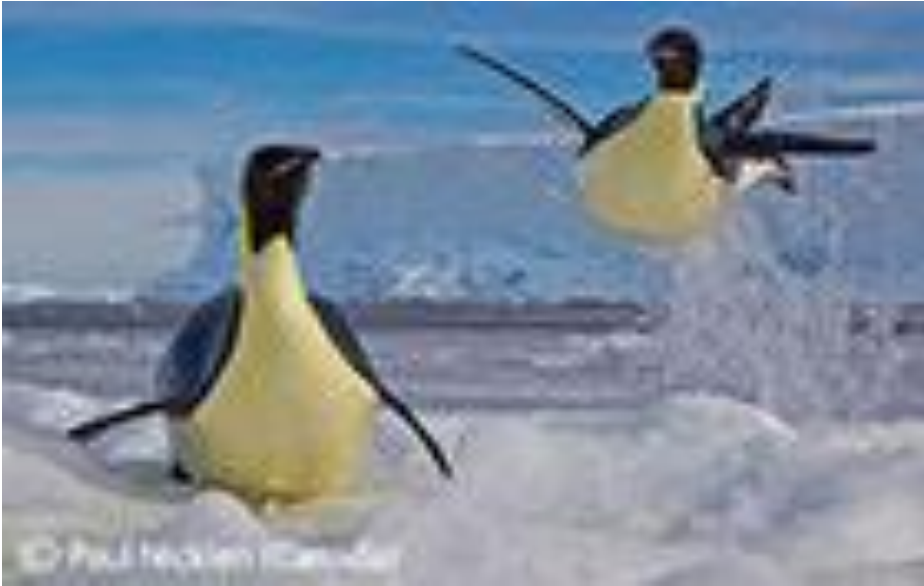
Fig. 10: British Fauna (Emperor Penguin by Paul Nicklen). Symbolic representation of fauna in “To Autumn” (LL.23-33)