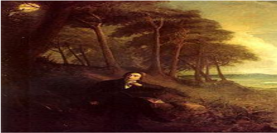
Fig. 12: John Keats, Listening to a Nightingale on Hampstead Heath by Joseph Severn. Web. 17 June 2012 http://keats.wikipedia.org "Ode to a Nightingale".