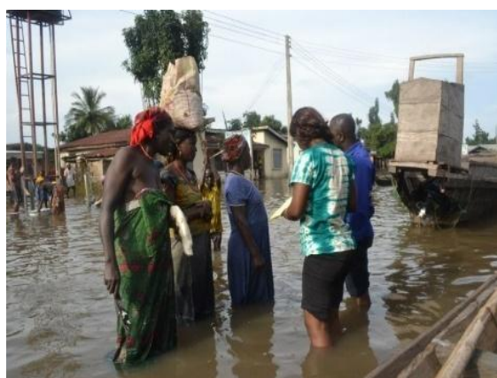
Fig.23: Flood Environment in Ahoada, River State by siteadmin Obayanju, Iyke and Uwaka