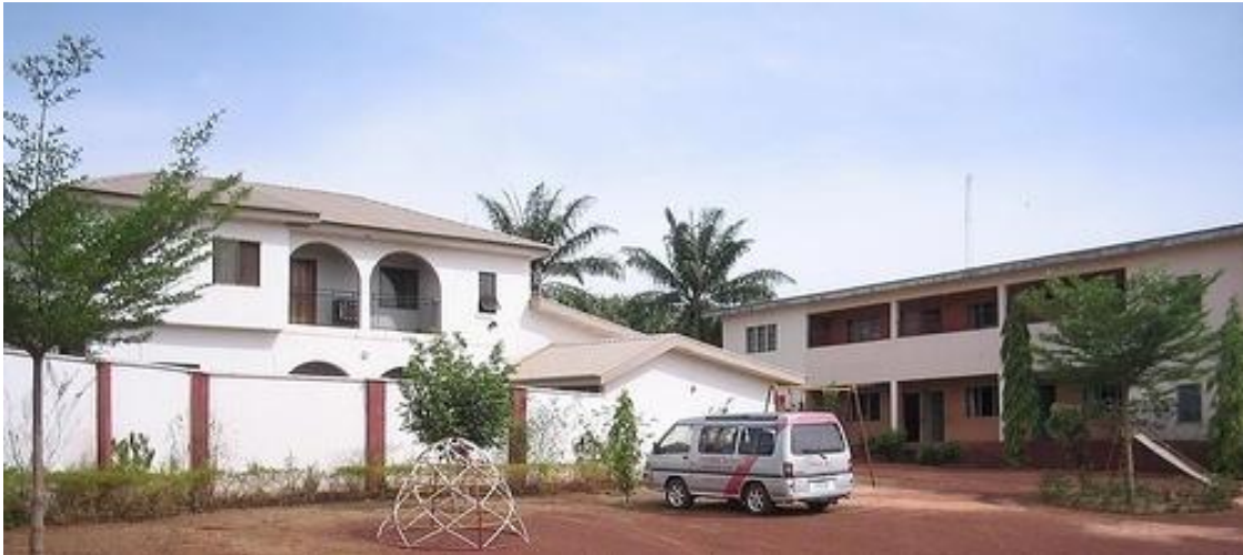
Fig. 20: Built Environment in Enugu by Olympus Optical