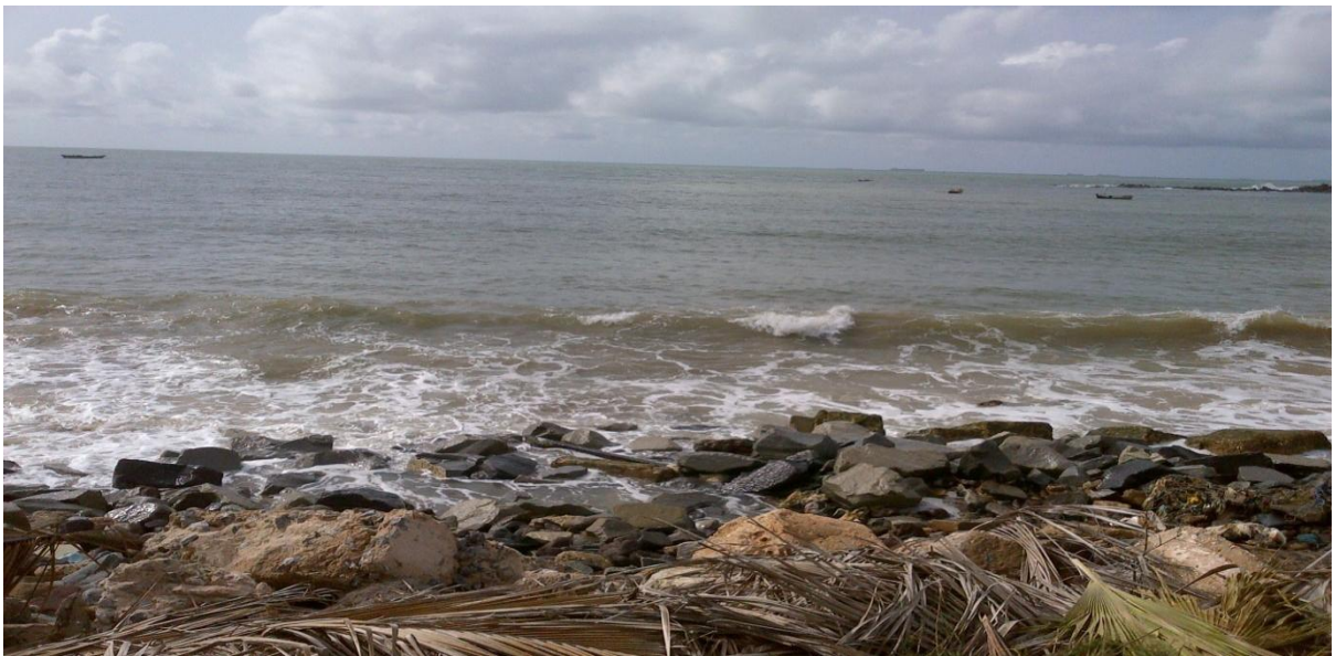
Fig. 8: The seascape, cloudy sky, canoes and boat in Lagos: A countryside, where the blue sky meets the blue sea.