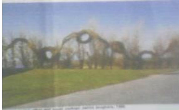
‘Running in circles’ willow and maple saplings, Patrick dougherty, 1996.