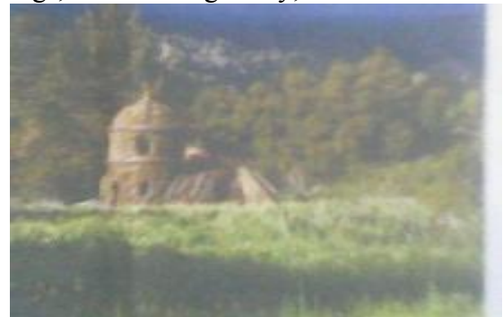
‘Toad hall’ by Patrick Dougherty, 2004