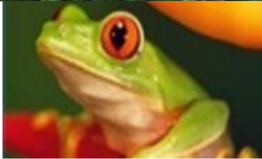
Fig. 6: Parrot (above) and Frog (below) Representing Fauna: “Forest Echoes” ( The Eye of the Earth , 1998:7-12). Animal Adaptations in Biome of the Tropical Rainforest (Wikipedia) olx.com.ng retrieved on 27 April 2013 from http://www.ehow.com/info