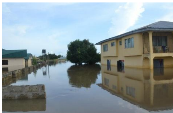
Fig.22: Flood Environments in Edo, 26 September 2012 by siteadmin Obayanju, Iyke and Uwaka