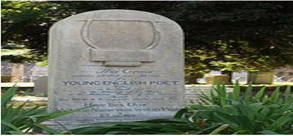
Fig. 4: Keats's gravestone in Rome

Keats' last request was to be placed under a tombstone bearing no name or date, only the words, "Here lies One whose Name was writ in Water." A name in water is a symbol of instability as in mortality. The tombstone stands as a symbol of constancy and permanency: the paradox that marks the life of Keats.