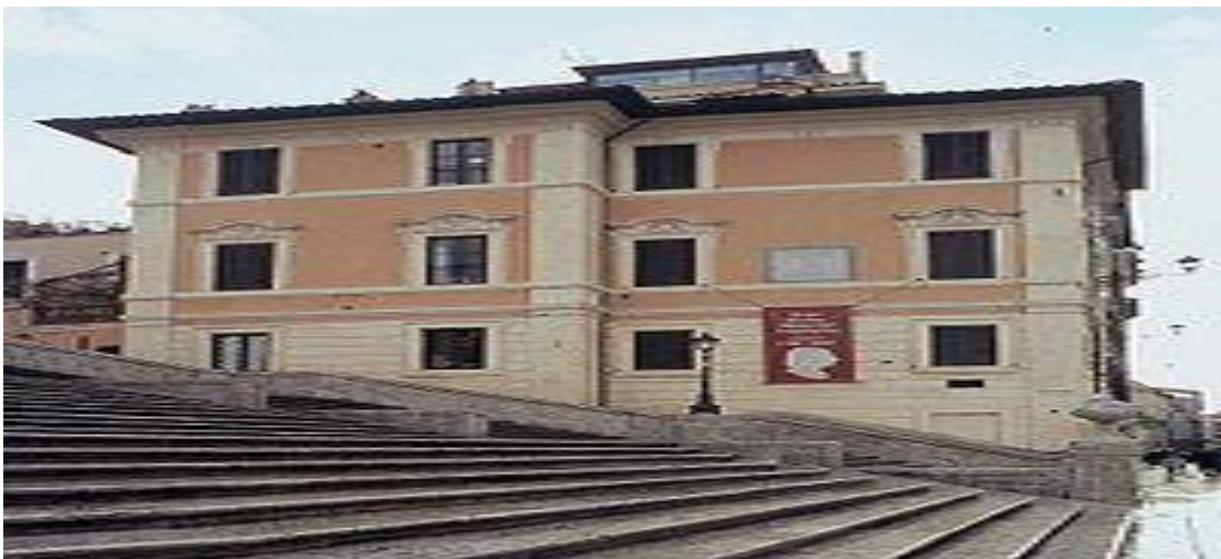
Fig. 3: Keats's House in Rome

These buildings symbolically juxtaposed immortality/mortality, the work of art/death of Keats respectively, as represented in "Ode to a Grecian Urn" (LL.11-14, 46-49)