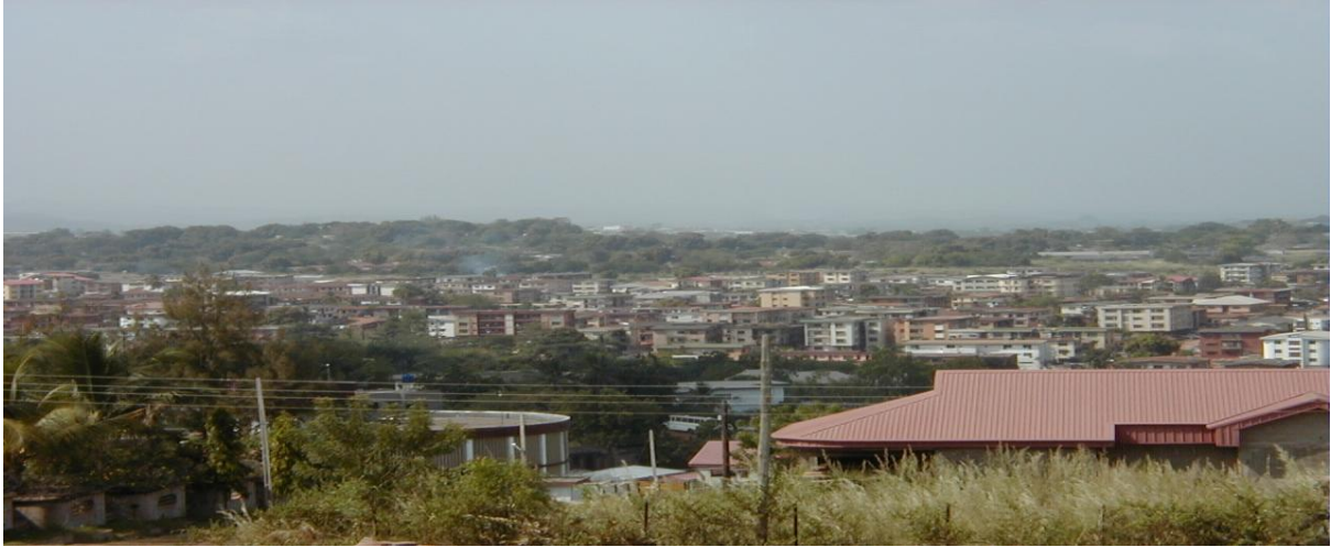
Fig. 18: Built Environment, Onitsha by Olympus Optical