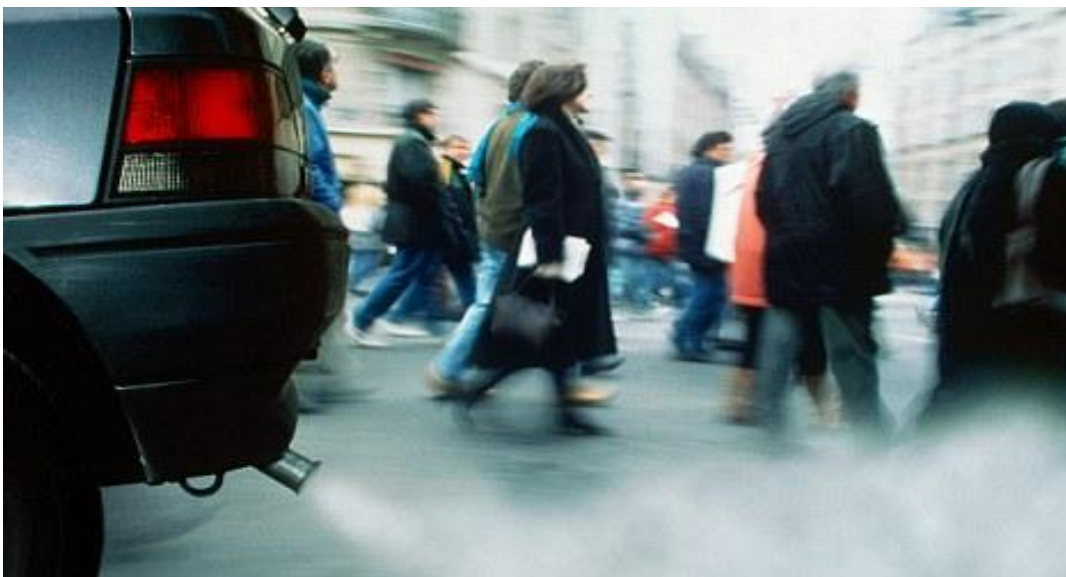
Fig. 17: Environmental pollution in the 21 st Century Britain. Wikipedia, Web: July 11, 2013. (Poor air quality is linked to respiratory disease, a major killer. By Daily Mail Reporter)