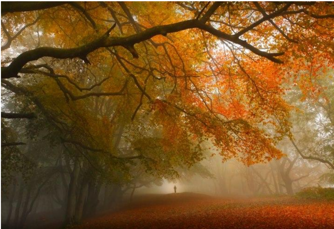
Fig. 11: British Flora. Web, 10 May 2013 http://britishflora.wikipedia.org Symbolic representation of flora in “Ode to a Grecian Urn” (LL.21-22) & ‘Spring’ in “To Autumn” (L.26)