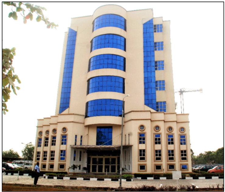
Figure 1: Covenant University Senate Building Façade