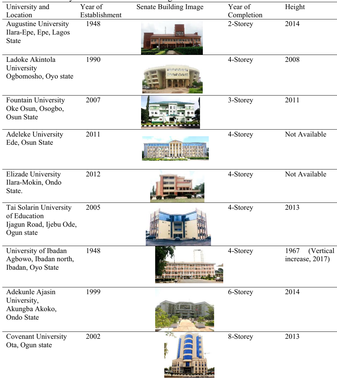
Table 1: Summary of Selected Senate building Façade

A summary of the content analysis of the ten selected university senate building façade images and height is presented in Table 1.