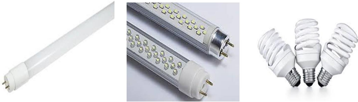
Figure 1: FT, CFL, and LED lamp