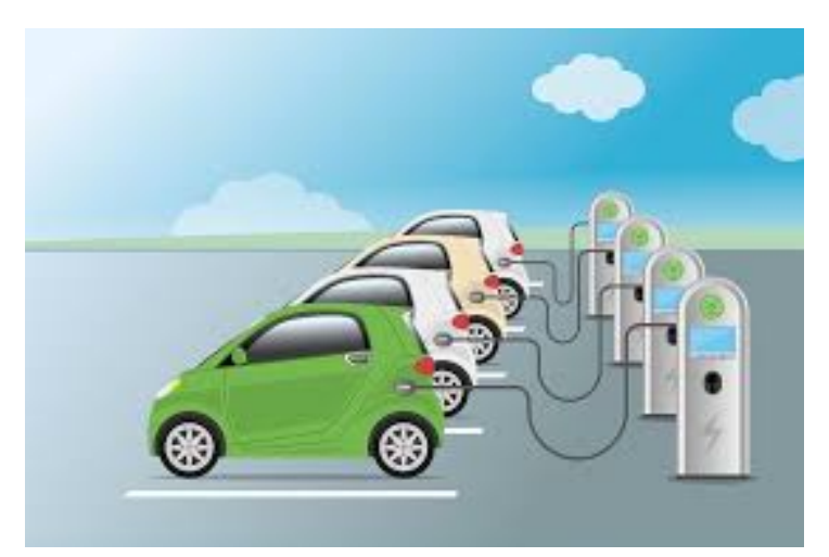
Figure 3: Outlook of Electric Vehicle Charging Station [15]