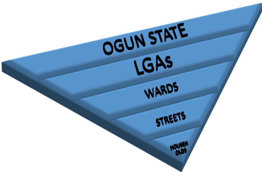
Figure 2.1: Sampling Stages

sampling interval was arrived at by dividing the number of households in the population by the number of households needed for the sample. The final stage of the sampling procedure entails the choice of one respondent per selected household. Hence, a total 1000 respondents were selected for the quantitative data using Taro Yamane’s formula for sample size calculation across the selected five LGAs. The essence of adopting this formula was because the population understudy was very large. However, in order to enrich the quantitative data, the researchers collected qualitative data using In-depth Interviews (IDIs) and Key Informant Interviews (KIIs). The inclusion criteria are all females in their respective reproductive years and post-menopausal females aged 15–69 years, persons who have had a close relation or friend with a diagnosis of breast cancer, and healthcare providers (doctors/nurses) from one of the healthcare facilities in the town/ward.