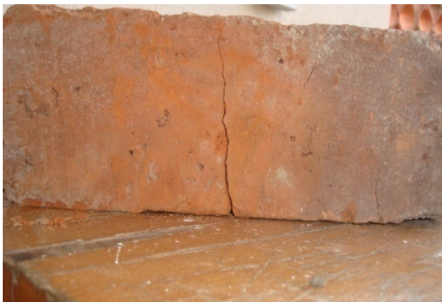
Plate 9: Crushed burnt brick (Sample A)