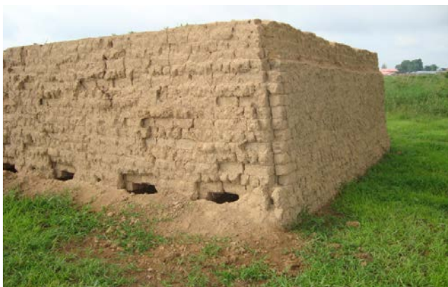
Plate 5: Staked bricks set for firing

When the bricks are well burnt, a cherry-red hue develops and this condition is held for about 6 hours. Sufficient fuel must be available when the burning starts as the entire batch of bricks might be lost if the fires were allowed to die down during the operation. Firing with wood took two to five days. The bricks were adjudged to have been thoroughly burnt when a part of the heap starts falling without the bricks breaking as seen in Plate 6. Burnt brick samples were examined by breaking off a part of the brick to see how the inner surface is; bricks not well burnt gave an inner colour of ash as in Plate 7 while well burnt brick gave a uniform yellowish brown colour same as the external surface.