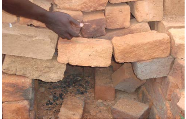
Plate 8: Stacked burnt bricks around firing channel