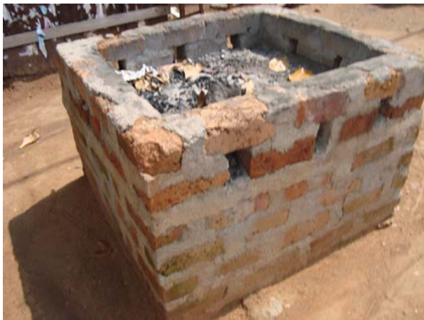
Plate 3: MBB used to construct an open Incinerator.