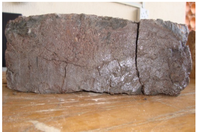
Plate 10: Crushed burnt brick (Sample B)

During the firing, the bricks shrink as much as 10%. As they were taken out of the staked batch after firing, they were sort to different grades with the main criteria being strength, irregular dimensions and sometimes cracks. Two classifications of good bricks always result from this process; well burnt bricks usually adopted for normal building construction (Sample A - those brick not in direct contact with fire source) and the over burnt referred to as iron-bricks - commonly used for drainages and waterlogged areas (Sample B - those brick in direct contact with fire source). Plates 9 and 10 presents Sample A having uniform yellowish brown colour and Sample B in dark grey/black shining charcoal-like colour.