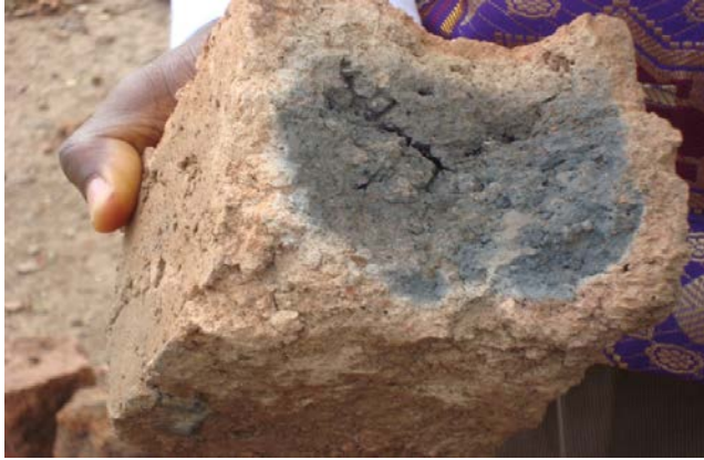
Plate 7: Inner ash colour of brick no well burnt