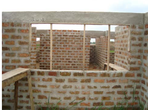
Plate 2: A modern structure being constructed using MBB.