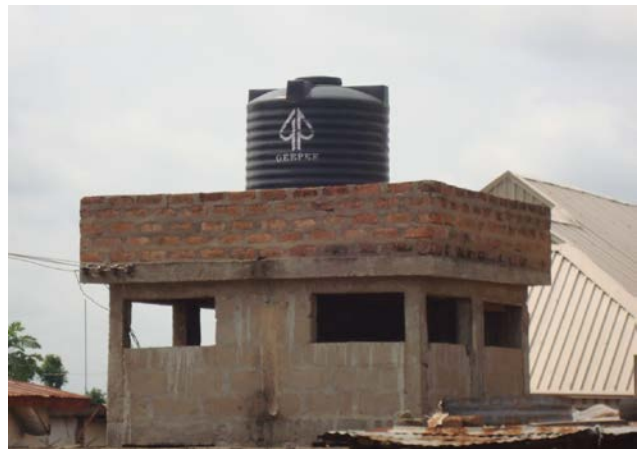
Plate 4: MBB adopted for the perimeter wall of a Water Tank Tower.

The MBB were said to be cheap, sold as low as #5/brick at normal period, while the highest price stands at #8/brick during the peak period as against the unit price of #100 and #120 for 150 mm and 225 mm sandcrete blocks respectively, implying masonry unit material cost of #235/m 2 to #376/m 2 using MBB as against #1000/m 2 to #1200/m 2 for sandcrete blocks. Hence a saving in masonry material cost of about 70% in wall. This is coupled with the fact that brickwall surfaces are often finished without additional