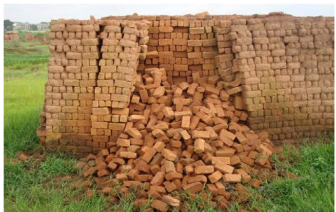
Plate 6: Staked bricks after firing