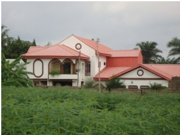
Plate 1: A modern structure built from MBB.

Makurdi Burnt Bricks can be said to fall specifically to the category of materials fitting into the scenario described by the researchers quoted above. The bricks were not only being adopted for modern building structures as shown in Plates 1 & 2, they are used for incinerators, drainage works, waterlogged sites and free standing walls of fence with little or no treatment as shown in Plates 3 & 4. The use of the MBB was noted not to be limited to private residential houses, public and corporate building structures were not left out. A good example is the wall of fence of J. S. Tarka Foundation Civic Centre in Makurdi.