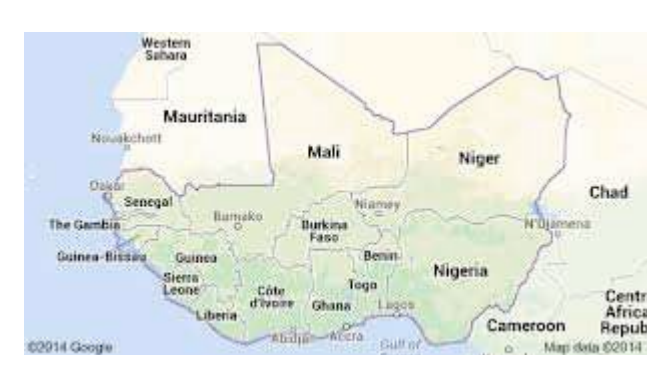
Fig. 1: Map of West Africa

Religious extremism in this chapter is defined in terms of the expression of extreme or violent actions or jihad on the basis of particular interpretations or understanding of religious teaching or scripture, especially the Koran. In particular, we examine the (online) communication behaviours of Islamic extremists/terrorist groups in West Africa and Somalia. And we focus on Boko Haram of Nigeria, Ansar dine , and The Movement for Unity and Jihad in West Africa (MUJAO) of Mali, and Al Shabaab of Somalia. An overview of these extremists under study is carried out below.