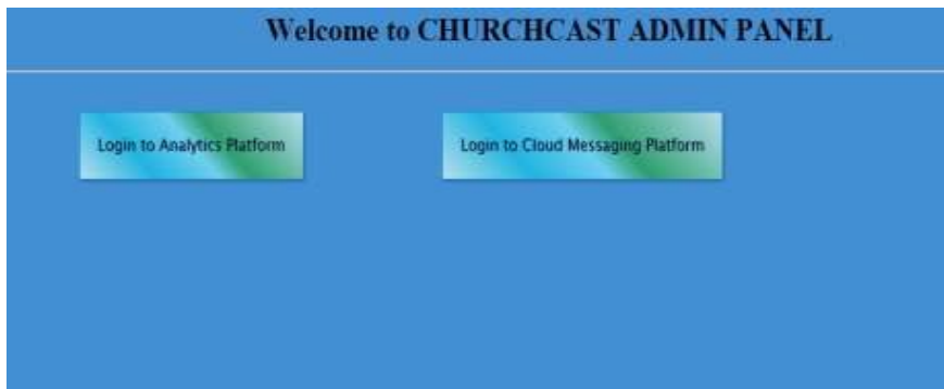
Fig. 3 Church cast Admin Panel

Fig. 3 below shows the Admin Welcome Panel consisting of two options from which the administrator can choose namely analytics platform and cloud messaging platform.