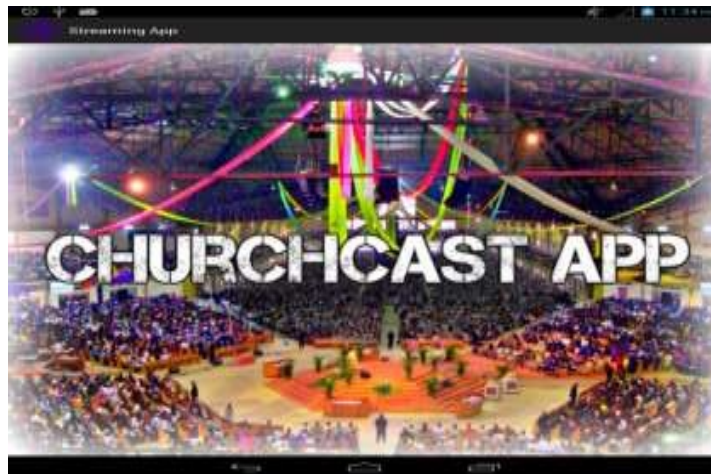
Fig. 2 Welcome Activity

Fig. 2 below represents the welcome screen of the application. This screen is programmed to remain on screen for about 3.5 seconds before the next screen appears.