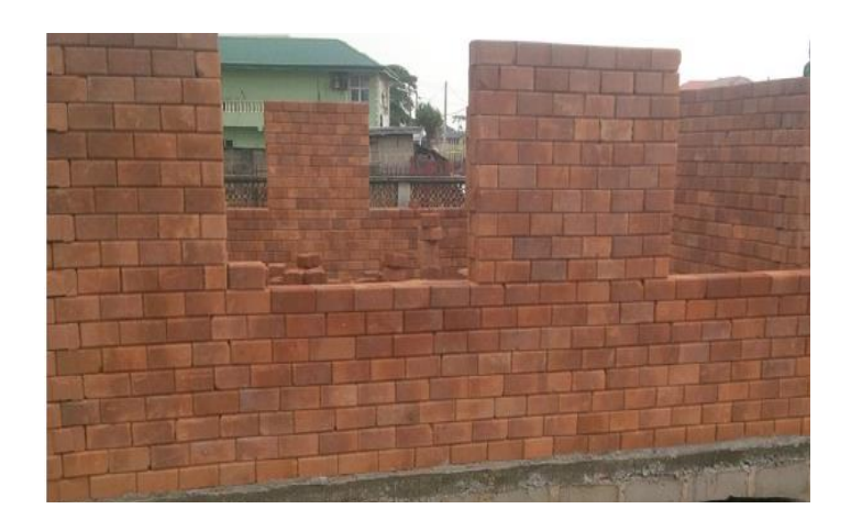
Figure 4. Dry-stacking of LIBs without mortar

Hydraform blocks offer faster rate of construction than conventional blocks [18]. In a day, about 21 m^2 of walls can be laid with 800 hydraform blocks by a bricklayer, hence making LIBs to be laid three times faster than conventional blocks; this also reduces the labour time per hour [18].