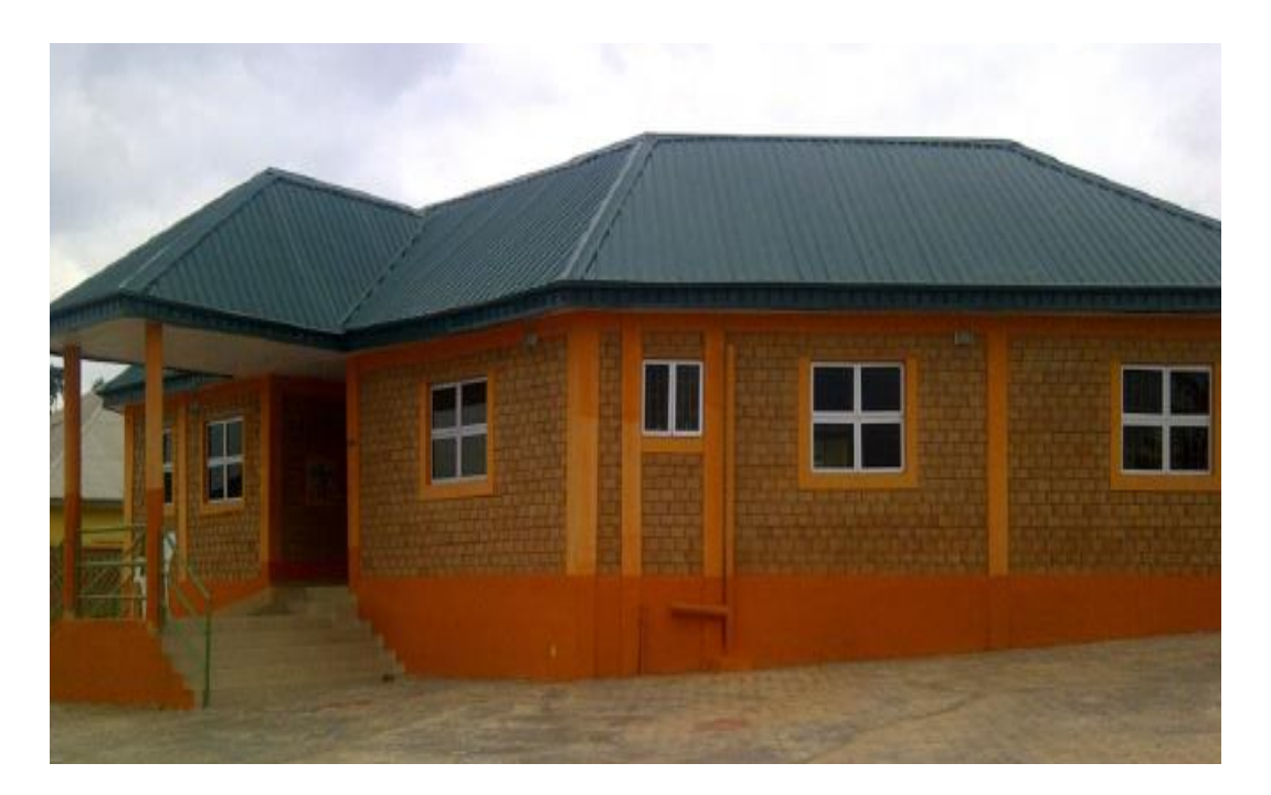
Figure 5. Construction of Heart Mega School using LIBs, Famese, Akure, Nigeria