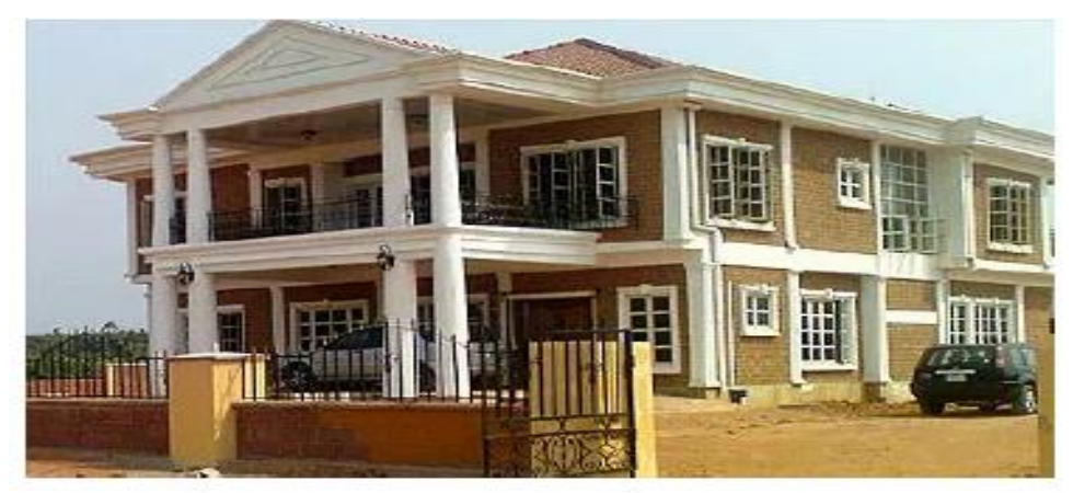
Figure 6. A residential building built with LIBs in Lekki, Lagos, Nigeria