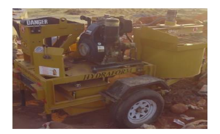
Figure 2. Hydraform hydraulic machine

IOP Conf. Series: Materials Science and Engineering 1036 (2021) 012044 doi:10.1088/1757-899X/1036/1/012044