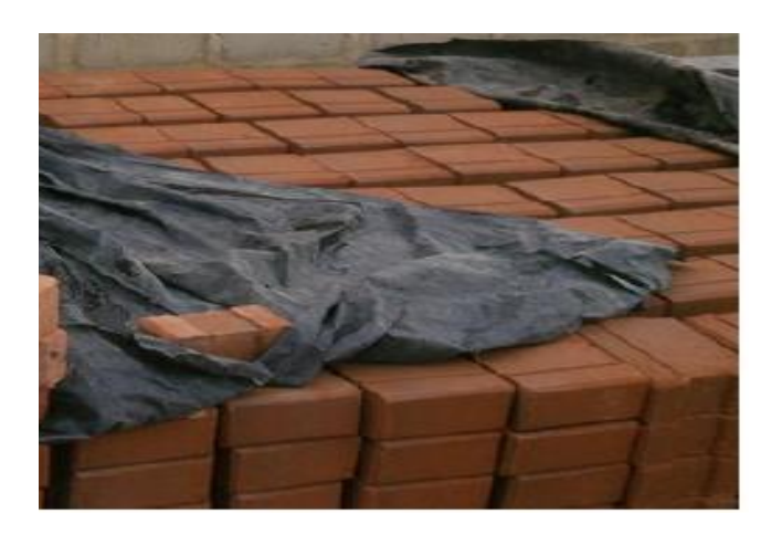
Figure 1 . Stacked hydraform blocks Source: Nairaland Forum, 2020 [16].

In the 20th century, traditional adobe or unfired laterite bricks were prevalent in some African countries [9]. However, in recent time, the search for more efficient, versatile, affordable, and eco-friendly blocks led to the development of hydraform blocks, otherwise called laterite interlocking blocks (LIB) [10]. Hydraform block, as shown in Figure 1, is produced from laterite, cement, and water, and compressed hydraulically with the aid of hydraform hydraulic machine (Figure 2), resulting in a high quality interlocking solid block [11], which is largely dry-stacked. Consequently, the Nigerian Building and Road Research Institute [NBBRI] designed an interlocking block machine, as shown in Figure 3, to produce LIBs, mainly comprised cement and laterite of ratio 1:20, respectively [12]. The designed concept was based on the LIBs with a geometric size 225 x 225 x 112 mm<sup>3</sup> [13]. The geometry is assembled without the application of mortar, hence making the laying concept to be differed from conventional blocks [9]. Hydraform blocks satisfied the specification of Industrial Building System [14], and have been used in many parts of the World for load bearing masonry structures [15].