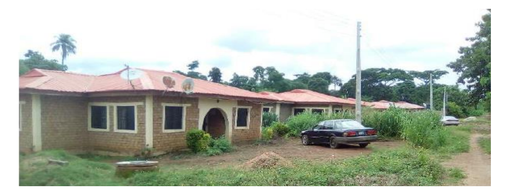
Figure 7. Pictorial view of Olusegun Obasanjo Housing Estate, Ado-Ekiti, Nigeria

In 2005, the Federal Government of Nigeria, through the Association of Housing Corporation of Nigeria (AHCN) in collaboration with the NBRRI, flagged-off the construction of 500 low-cost housing units in each state of the federation and the Federal Capital Territory (FCT) using LIBs [29]. NBRRI provided the fabricated interlocking block-making machines, while the Federal Mortgage Bank OF Nigeria (FMBN) provided the funds needed for the construction. Consequently, Ekiti State, through the Ekiti State Housing Corporation, executed the project, completed, and named it as Olusegun Obasanjo Housing Estate, Ado-Ekiti, Nigeria, as shown in Figure 7. The housing units were allocated to civil servants, mostly, the low-income category.