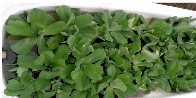
Figure 2. Water Lettuce plant.

A pilot study by Lu (2009) showed that water lettuce growth resulted in a reduction in EC as a result of salt removal from the waters by plant root adsorption. Also, turbidity, NH 4 -N, total solids, NO 3 -N, total nitrogen and other nutrient concentration were reduced to optimum levels. Consequently, the water quality of the treatment reactor was greatly improved due to phytoremediation by water lettuce.