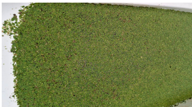
Figure 3. Common duckweed plant.

The ability of duckweeds to withstand high nutrient concentration, temperature and pH value, enables it to provide efficient phytoremediation of various wastewater when used in constructed wetland systems. In a single study, where primary and supplementary treatment processes could only guarantee 50% BOD 5 and phosphate reductions, duckweed was able to reduce these elements to about 94.45% and 79.39%, respectively (Priya et al., 2012). In addition, as a result of duckweed's increased nutrition load, total nitrogen and phosphorous removals were 98% and 98.8%, respectively, with an improved dissolved oxygen level (Mohedano et al., 2012). These reports concluded that