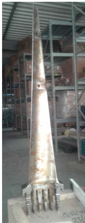
Figure 2: Last stage low pressure turbine blade

Figure 2 shows the image of the last stage low pressure turbine blade currently in use at Egbin thermal power plant. The operational parameters of this turbine blade are as presented in Table 1.