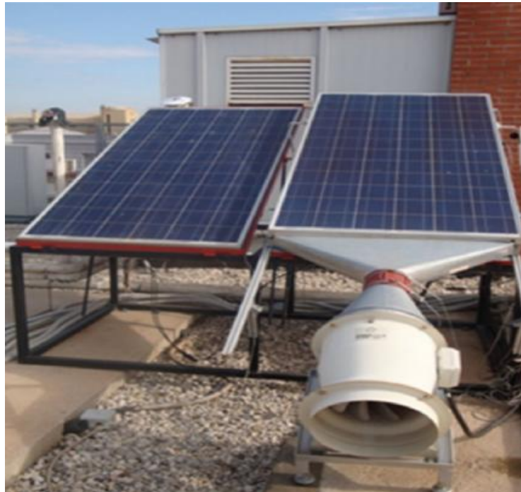
Figure 3: Solar panel with and without cooling fan[20]