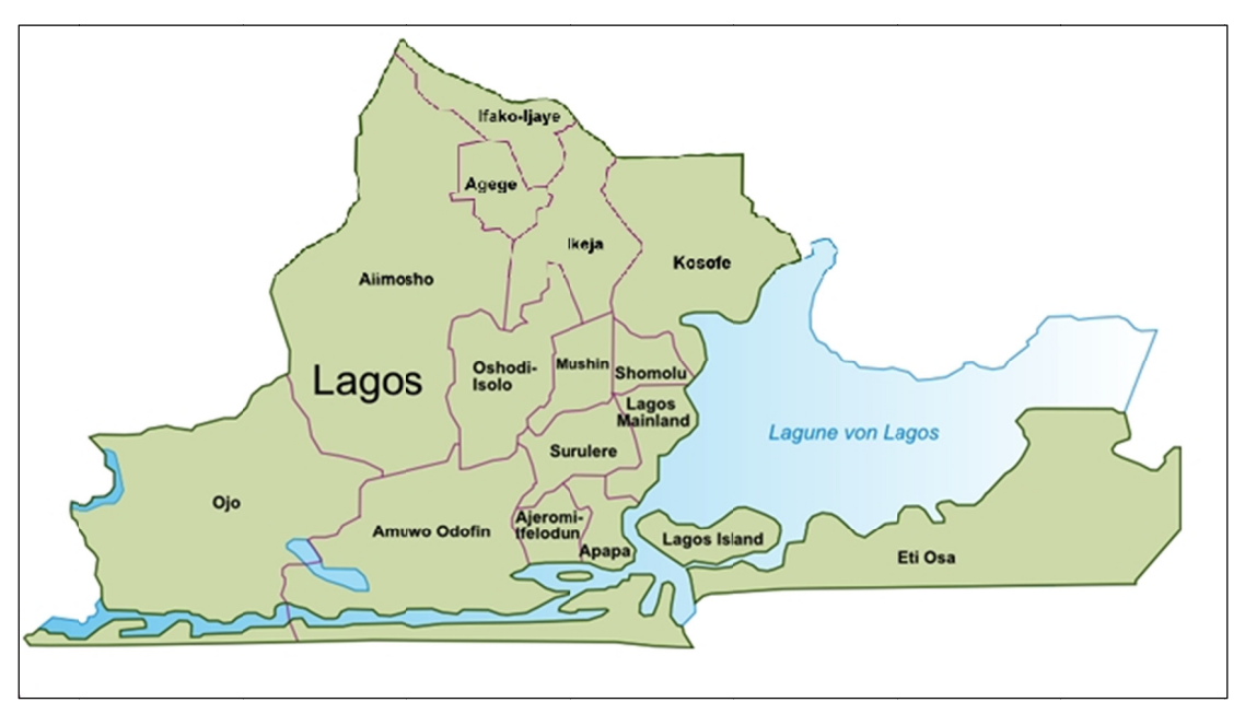
Figure 1. Map of the local government areas within lagos metropolis

completed questionnaires which are subsequently used for the analysis. Descriptive statistical tools such as tables, frequencies, percentages and charts are subsequently used to present the result. Analysis of the data collected entailed the use of percentages and frequencies. The results are presented using charts and tables.