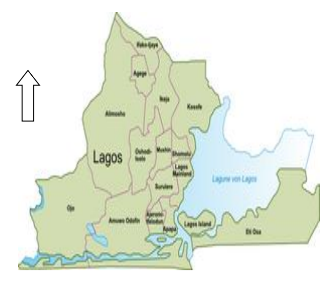
Figure 1: Map of Metropolitan Lagos.

Response rates of 56.8% and 53.5% were achieved for Surulere and Alimosho areas respectively while a 76.2% response rate was gotten for registered Estate Surveying firms. In a bid to further understand powerlines, an in-depth interview with the Managers and field officers of the Akangba and Alimosho PHCN sub station was conducted for the purpose of this research. In all, the survey recorded an average response rate of 66.5% and collated data was analysed using the relative importance index (RII).