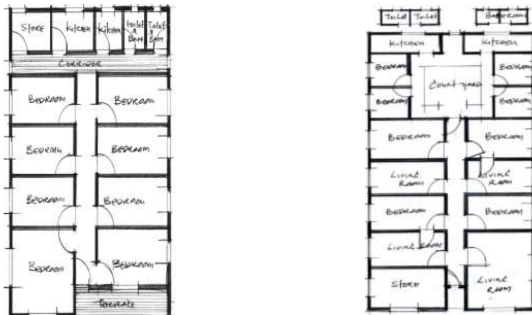
Fig1a & b: A Typical Floor Plan of a Central Corridor House (“Face Me I Face You”)

awareness/orientation amongst others. However the indicators of non-functional design include inadequate ventilation, poor natural daylight, poor acoustics, poor furnishing/equipment, poor ergonomics and poor building materials usage. An example of a non-functional architectural plan is “the central corridor house” otherwise known as “face me I face you” as shown in figure 1. This house type dots the residential landscape of Nigeria major cities. It is preferred by residents (urban poor) because it is cheaper to rent and by commercial home owners because it is easy to build, cheaper to maintain and guarantees quick return on investment. But occupants of “the central corridor house” suffers from SBS, BRI and BAS which are threats to their longevity.