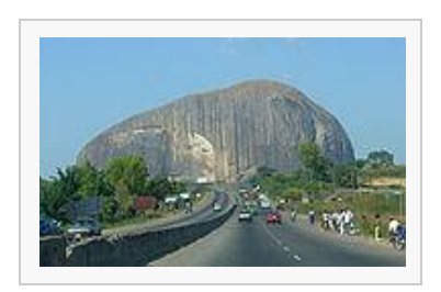
Zuma rock, near Abuja; Source: NWE (2012)