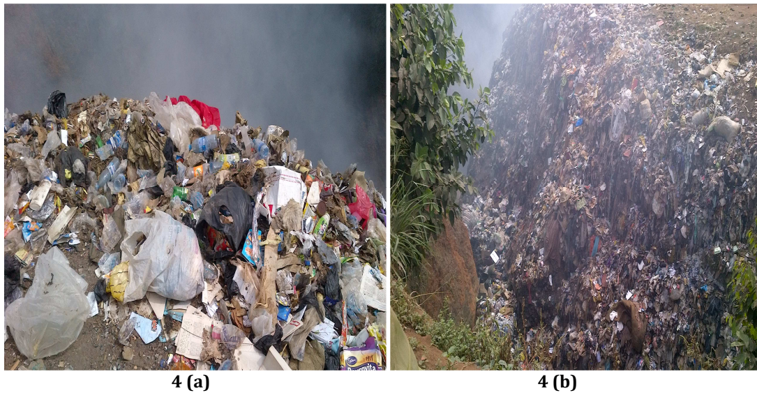
Figure 4 Composition of Waste at dumped and burnt at the dump site

waste paper and carton is sold for about ₦32,000, while other items are sold for ₦30, ₦30, ₦30 and ₦40 for plastic, glass, Tin can, and Nylon, respectively. These prices were given by the respective local vendor who buys and packed the materials for sale to recycling plants and companies in Lagos, Nigeria. Figure 4a shows the composition of potential recyclable waste stream that are indiscriminately dumped, while 4b shows the waste being burnt at the dump site.