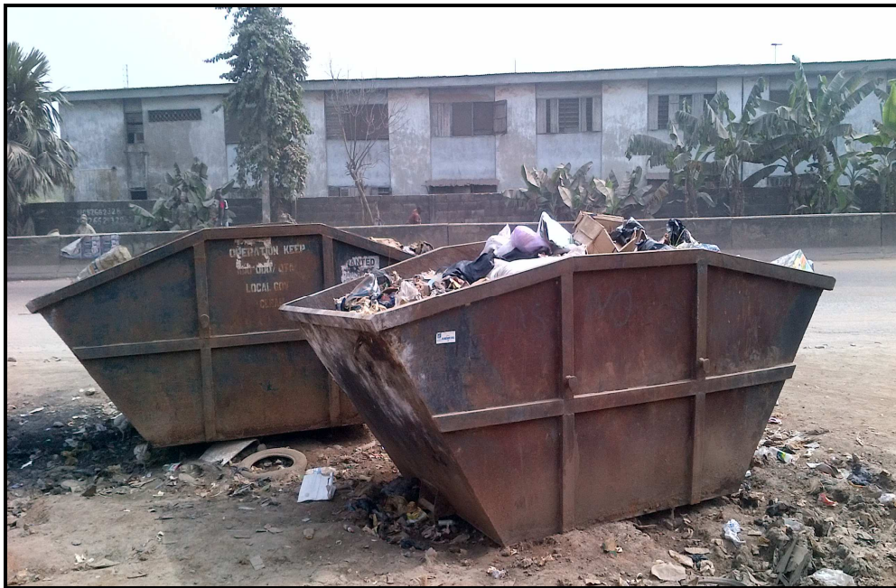
Figure 3 : Waste Collection bins provided by the Local Government at one of the locations

waste bins because it is also a residential area, and toll gate has only one waste bin because it is a transition point with varying population for motorist and people moving in and out of Ota. Figure 3 shows the waste collection bin at one of the locations.