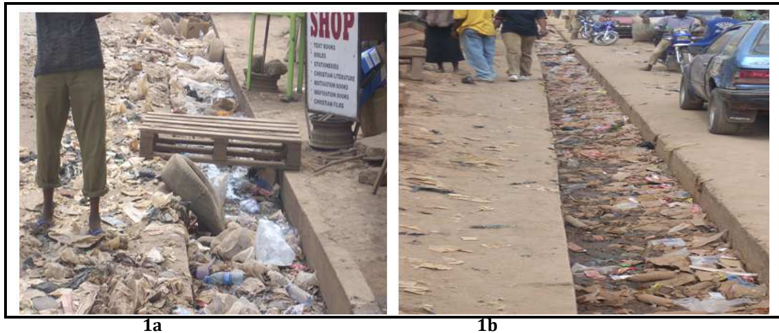
Figure 1: Indiscriminate Dumping of Waste in Drainages and Along the Road Sides

implemented environmental guidelines that complicate such problems.