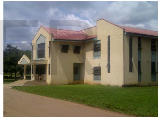
Fig. 1: View of the Camp House B (block 1) showing the physical condition of the building

The buildings were constructed with reinforced concrete post and beam structural system. Floors of the internal spaces were tiled with vitrified ceramic tiles at the entrance lobby, lobbies and wet area while the rooms were tiled with enamelled ceramic tiles. The windows are dark anodized aluminium projected windows while entrance doors are also glazed dark anodized aluminium double swing doors. The doors to the rooms are painted hardwood timber panel doors. Long span aluminium roofing sheets adorn the roof of the building. The external walls are rendered with cement/sand rendering and decorated with textured paints, other interior spaces such as lobbies and lounges were also decorated with textured paints. The room walls were however decorated with emulsion paints.