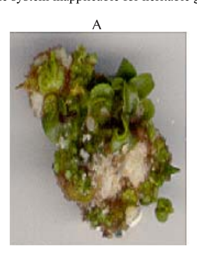
Figure 1A. In vitro cowpea regeneration from cotyledonary nodes cultured on 0.5 mg/l of benzyl amino purine (BAP).