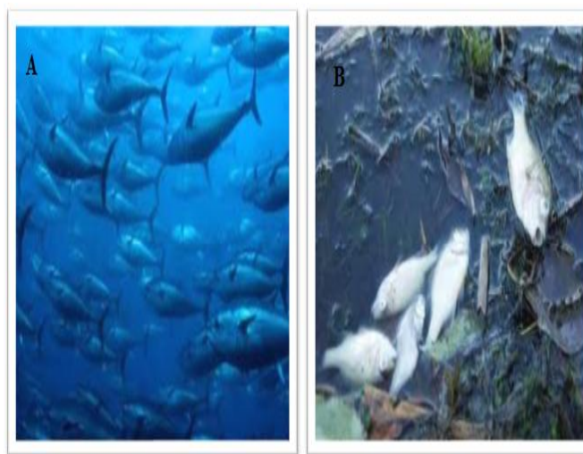
Fig. 1 Map showing unpolluted water (A) and polluted water (B)

(Ahmed and Reazuddin 2000). Urban wastes, on the other hand, cause organic enhancement and spread pathogens of devastating and serious sickness. Federal Ministry of Health gave a statistics in 1994 that only about 30% of Nigerian have access to potable water (Dada and Ntukekpo 1997; Ajala 2009 ) while in the same year, United Nations estimated that 1.2 billion people lacked access to potable water worldwide (Oyeku et al. , 2001).