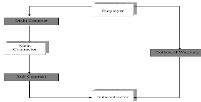
Figure 2: Relationship in a Subcontract

Source: Adapted from Fong (2004 cited in Christophe & Franck, 2013)