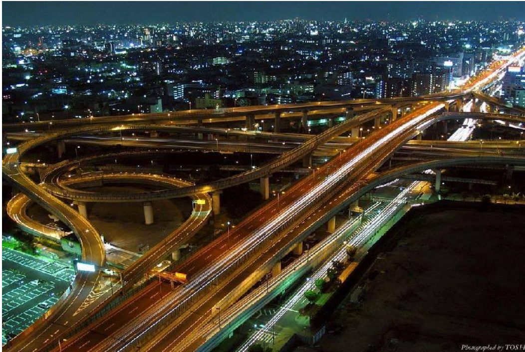
Figure 6: Envisioned Abuja Township in 2030/50