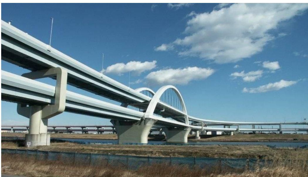
Figure 4: Visualized Third Mainland /Lokoja Bridge in 2020/25

The ongoing dredging of river Niger in Nigeria from the Atlantic Ocean to the Federal capital, Abuja, which is nearing completion, will open up a lot of the coastal towns and villages to development. Some of them will eventually evolve into mega cities as well.