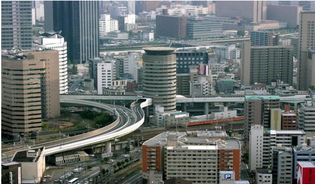
Figure 3: A Visualized Ikeja Business District for 2020/2025

This ambition calls for sustainable development with massive investments in infrastructure such as road networks, power supply, water supply, transport system, health system, etc. The most economical way is to start the plan now, because it is cheaper to make reservations for road networks, relocate owners of ancient buildings, develop water/energy supply and sewage system to match the new look of the city and the expected population.