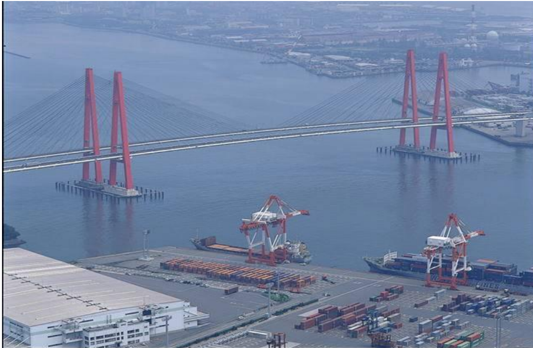
Figure 5: Visualized Lokoja, Niger and Lokoja Sea ports [Source: Adapted from Shaba, 2009]

environment professionals should put on their thinking caps to contribute to these emerging trends