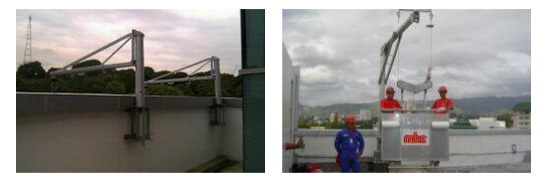
Figure 3a&b: Rigging system

• Monorail System: This provides access to building facade through the running of a single track that runs along the exterior facade with compliance to the shape of the building. Smooth running trolleys mounted on the monorail track allows a suspended gondola to move along the building horizontally or at inclined angle without inhibition. Control can be manipulated manually or electrically along the monorail tracks. For a climbing monorail, a high performance climbing trolley runs along the inclined monorail to suspend and traverse a gondola cradle. It is capable of climbing any slope vertically with a load of 500kg.