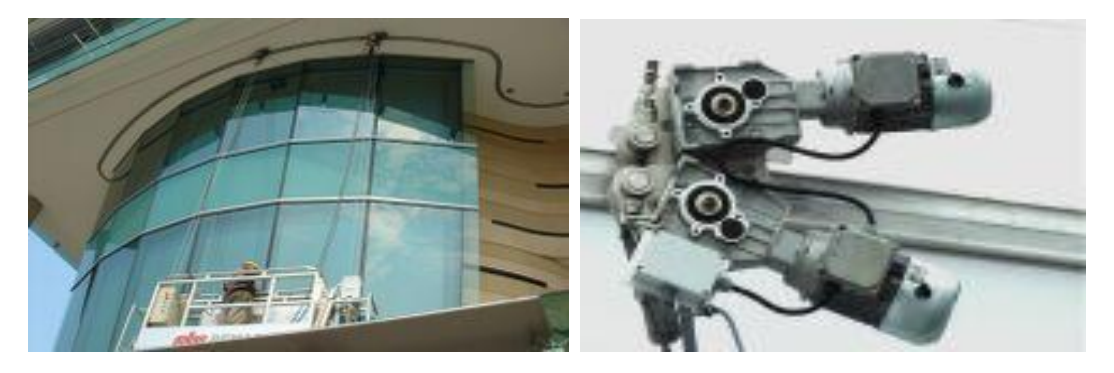
Figure 4a&b: Monorail system

• Monorail System: This provides access to building facade through the running of a single track that runs along the exterior facade with compliance to the shape of the building. Smooth running trolleys mounted on the monorail track allows a suspended gondola to move along the building horizontally or at inclined angle without inhibition. Control can be manipulated manually or electrically along the monorail tracks. For a climbing monorail, a high performance climbing trolley runs along the inclined monorail to suspend and traverse a gondola cradle. It is capable of climbing any slope vertically with a load of 500kg.