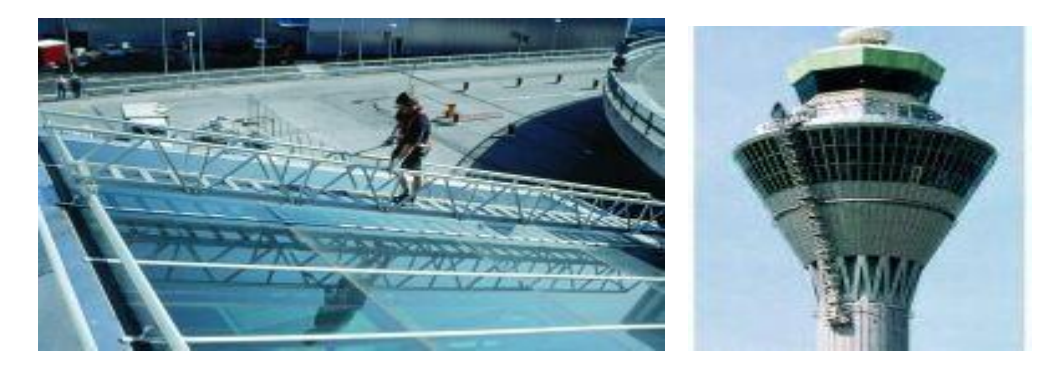
Figure 6a&b: Ladder and gantry system

• Fall Arrest System: A multi-storey building maintenance works require safety precautions. Working in height is fraught with danger, risk of injury and even death of persons (Salentine, 2011). Bresline (2011) affirms that fall from height have social and economical cost which impact negatively on the workers, the contractors, construction industry and the community at large. The fall arrest system provides a continuous protection throughout the time of carrying out maintenance works by a worker. It is meant to stop a free fall from heights. It can be installed both horizontally and vertically.