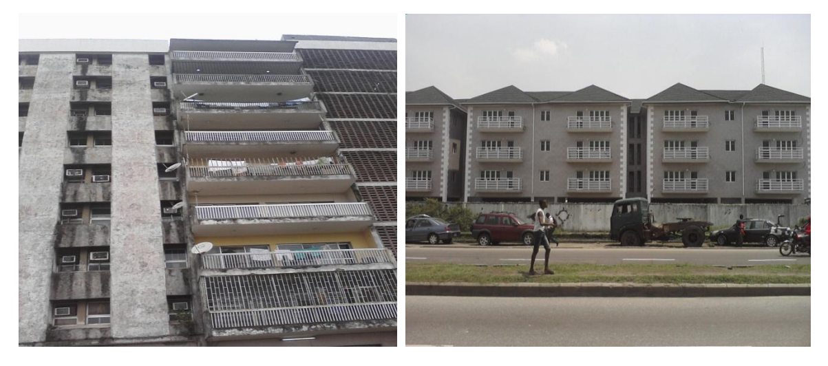
Figure 11a&b: Multi owned building and Single owned building.

It also shows the frequency of repainting for single owned buildings to be 4years while the frequency for multi owned building is 13years.