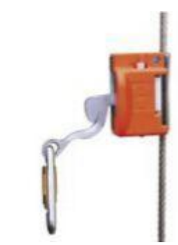
Figure 7a&b: Fall arrest system

• Access Work Platforms: These are safe temporary platforms for workers to stand on with their tools and equipment while working at heights. They are also referred to as elevating work platforms, boom lifts, cherry pickers and spiders .they are self balancing that prevent fall from heights.