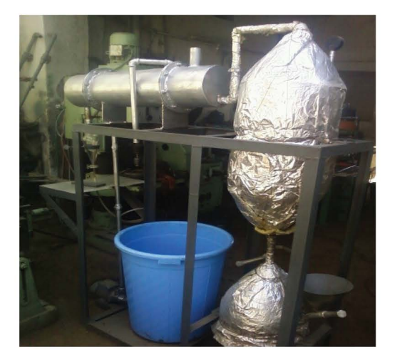
Fig.2 Assembly of the fabricated plant

The components of the plant designed such as steam generation unit, stripping chamber, condenser and support frame were fabricated and assembled to obtain the plant. An assembly of the fabricated plant is shown in Fig.2 below.